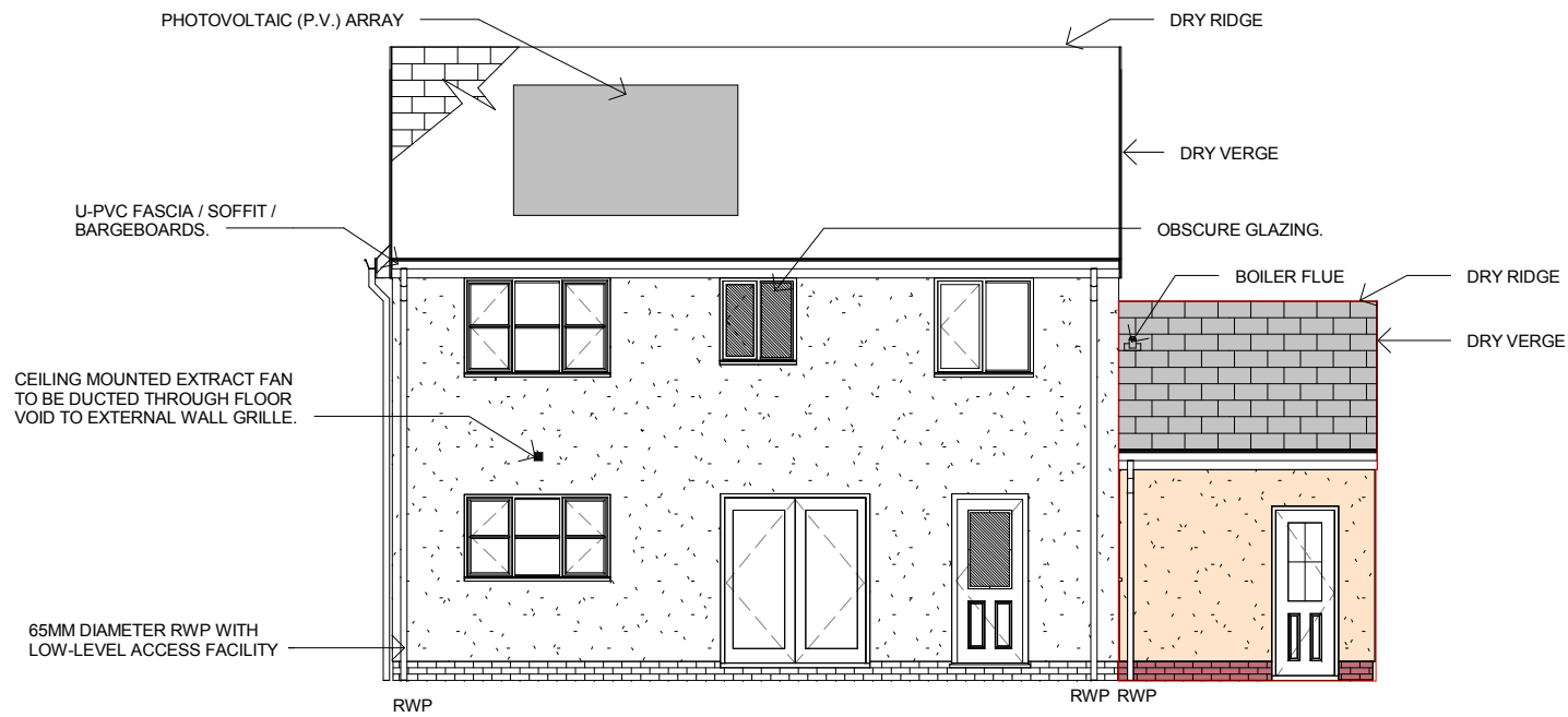
1 Proposed Rear 1 : 100