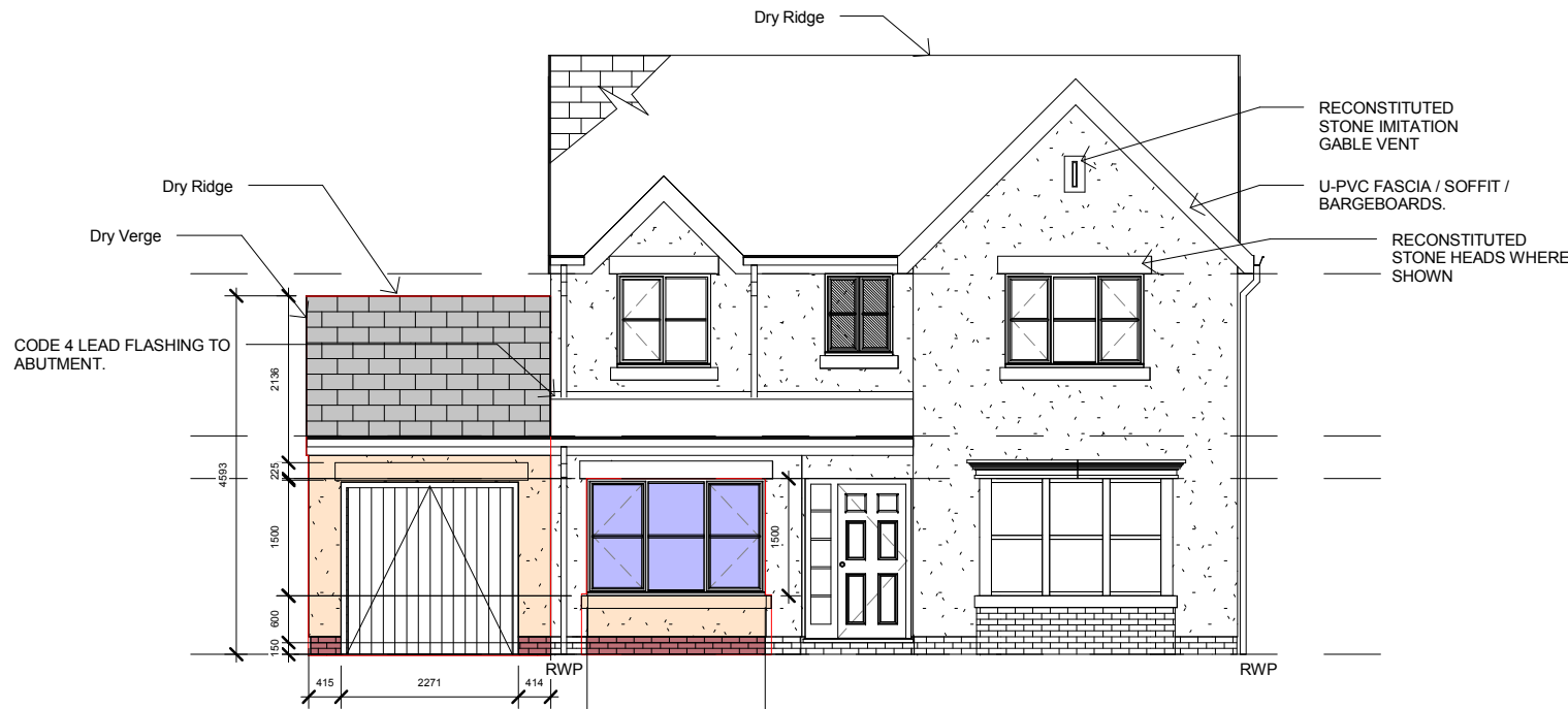
3 Proposed Front Elevation 1 : 100