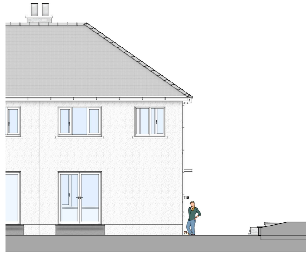
E :: EXISTING REAR ELEVATION