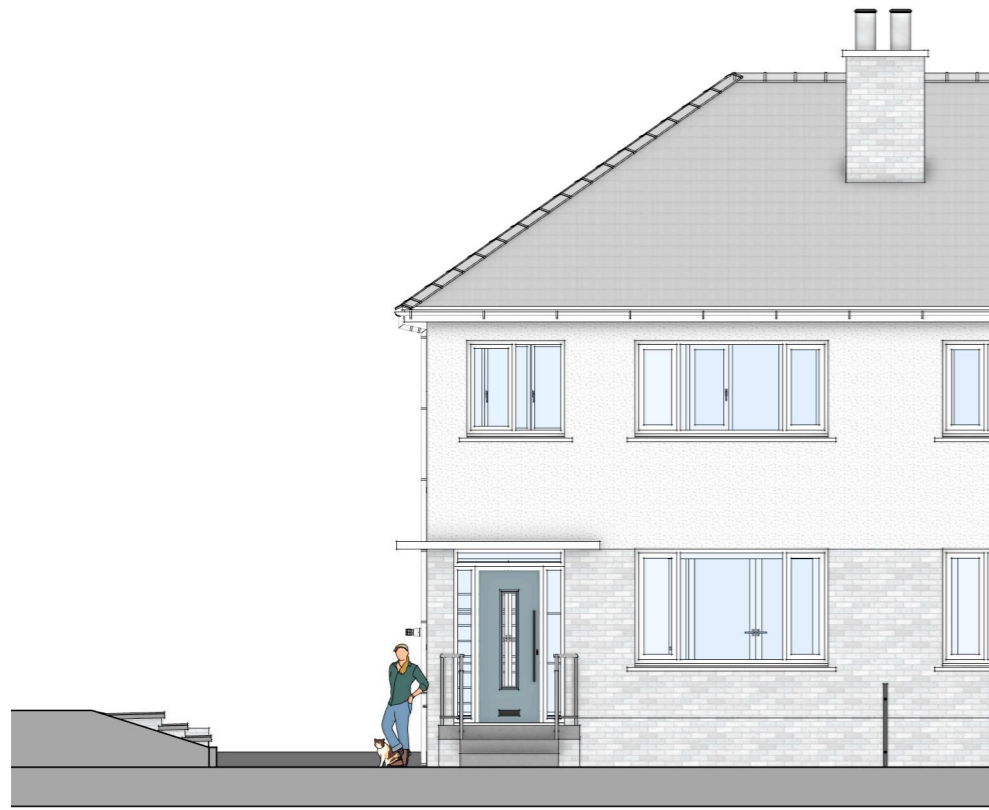
E :: EXISTING FRONT ELEVATION