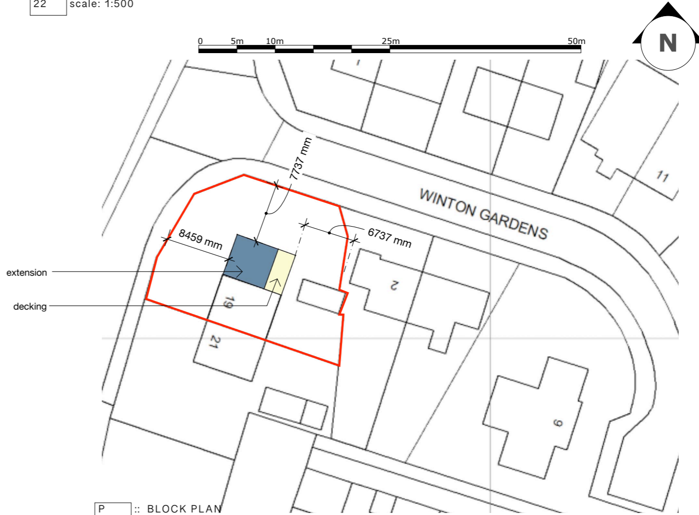
P :: BLOCK PLAN 22 scale: 1:500