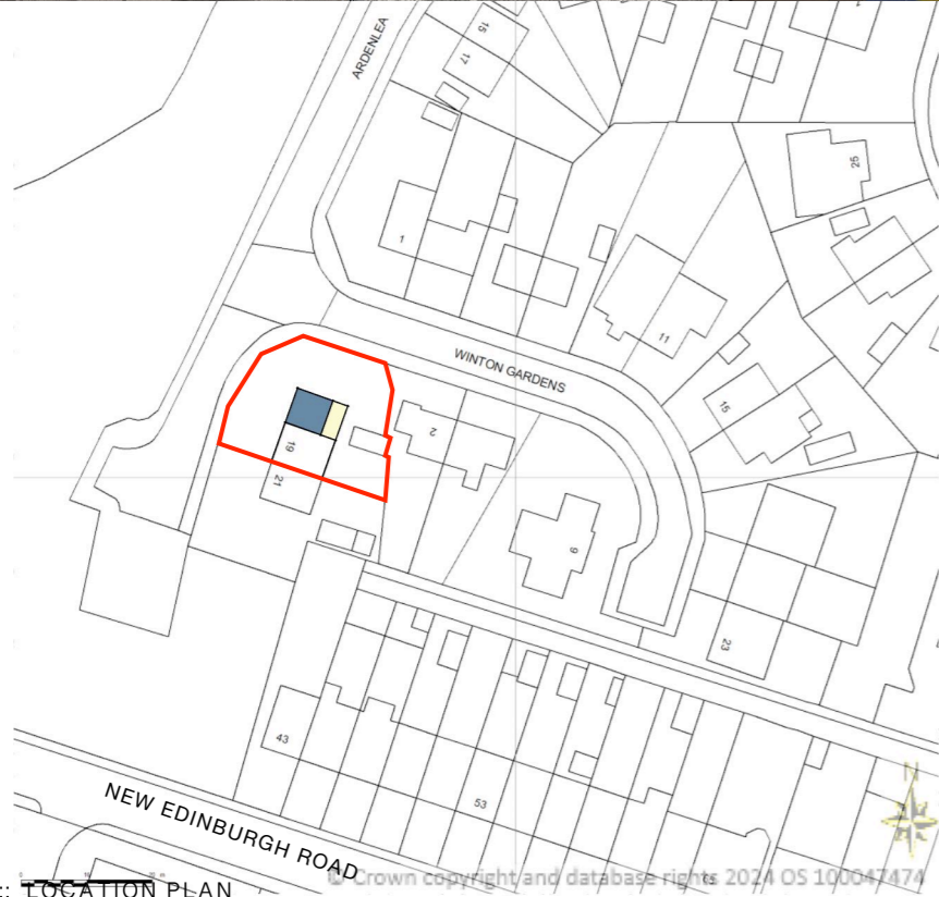
P :: LOCATION PLAN 22 scale: 1:1250

Crown copyright and database rights 2021 OS 100047474