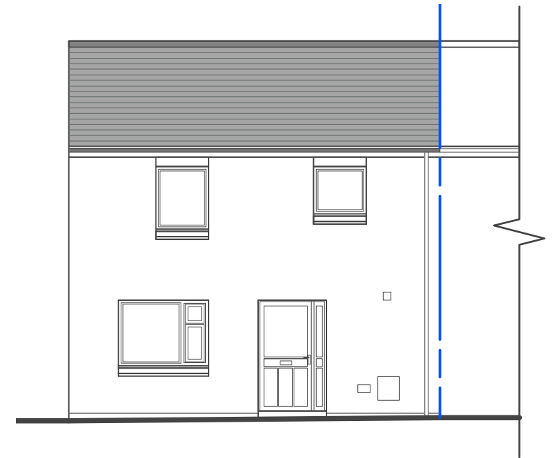
EX. FRONT ELEVATION 1:100