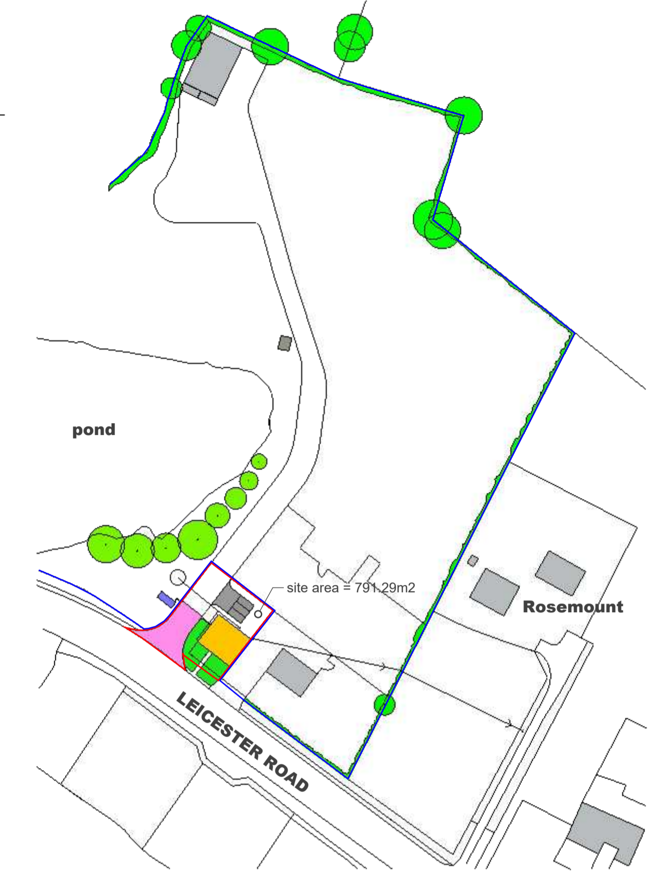
LOCATION PLAN 1 :1250

new vehicle access min 8.3m wide with 10m radii with a gradient of 1:12 for a distance of 11m behind the highway boundary with visibility splays as approved by HA