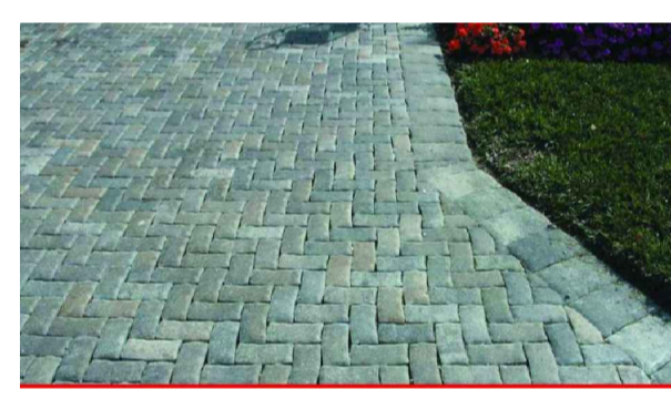
IMAGE 8 - CONCRETE PAVING ACROSS PROPOSED ACCESS & PARKING AREAS "Indicative Only"