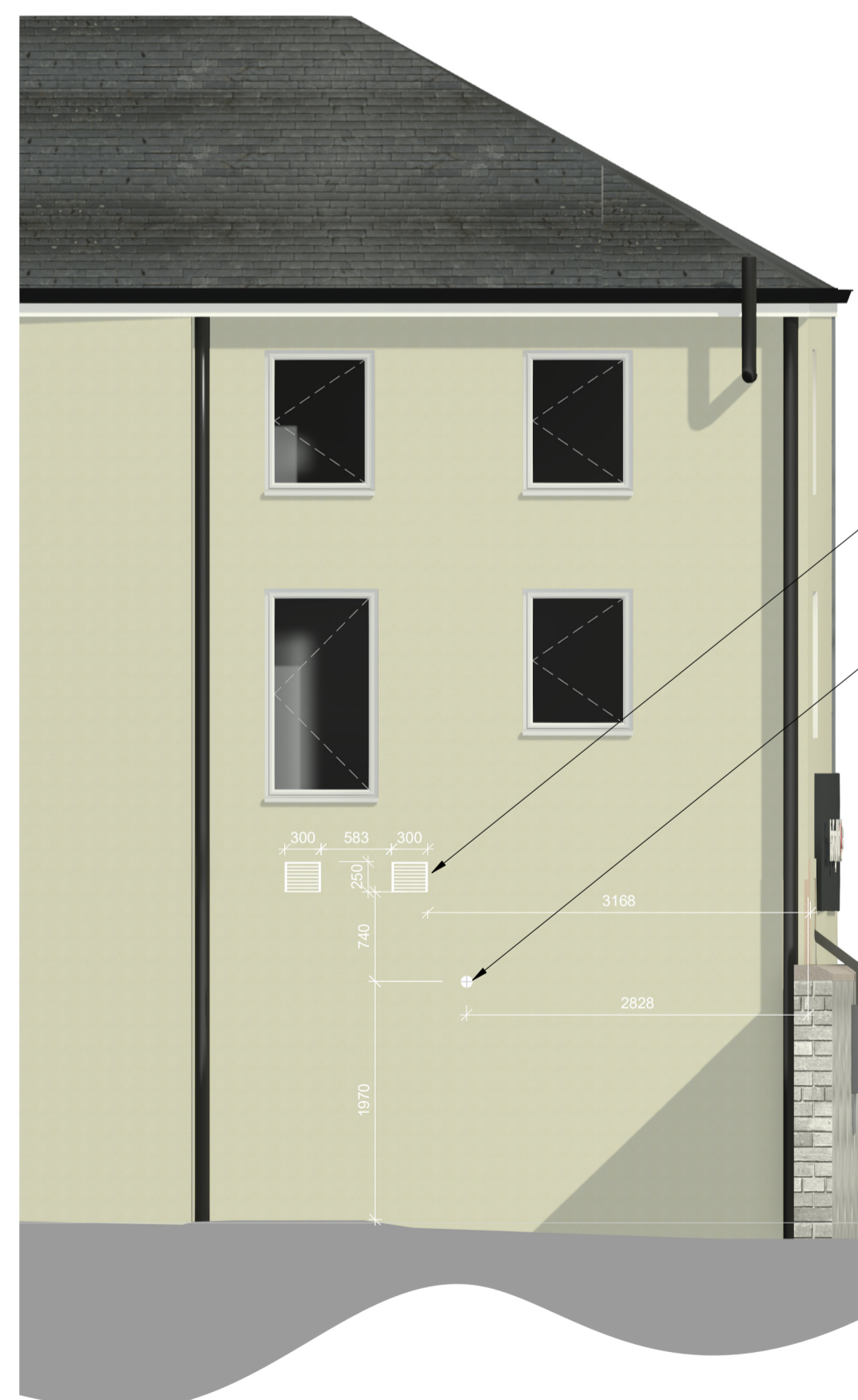
Proposed East Elevation - Rear 1 : 50

Proposed weather louvers spaced 1000mm apart and sitting at 2300mm FFL