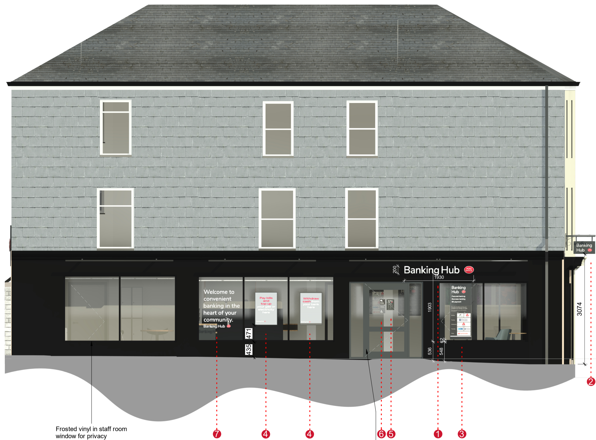
Proposed West Elevation - Front 1 : 50

New automated door, painted Dulux Trade Diamond Eggshell (15% gloss) RAL7021 Black Grey