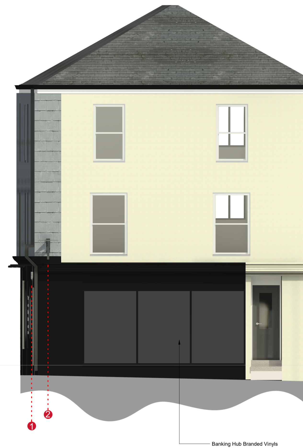
Proposed South Elevation - Front 1 : 50

Frosted vinyl in staff room window for privacy