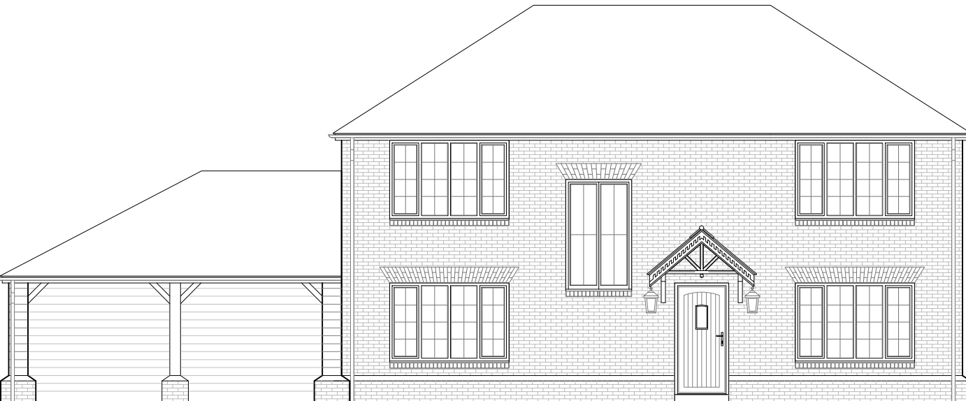
Front Elevation 1:100 @ A3