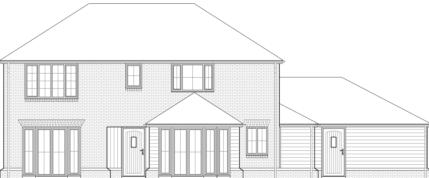
Rear Elevation 1:100 @ A3