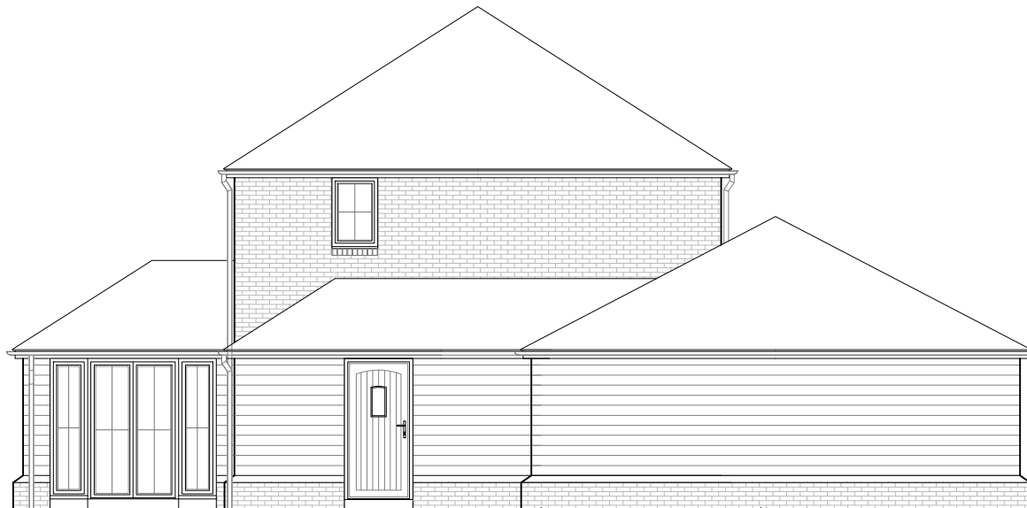
Left Elevation 1:100 @ A3