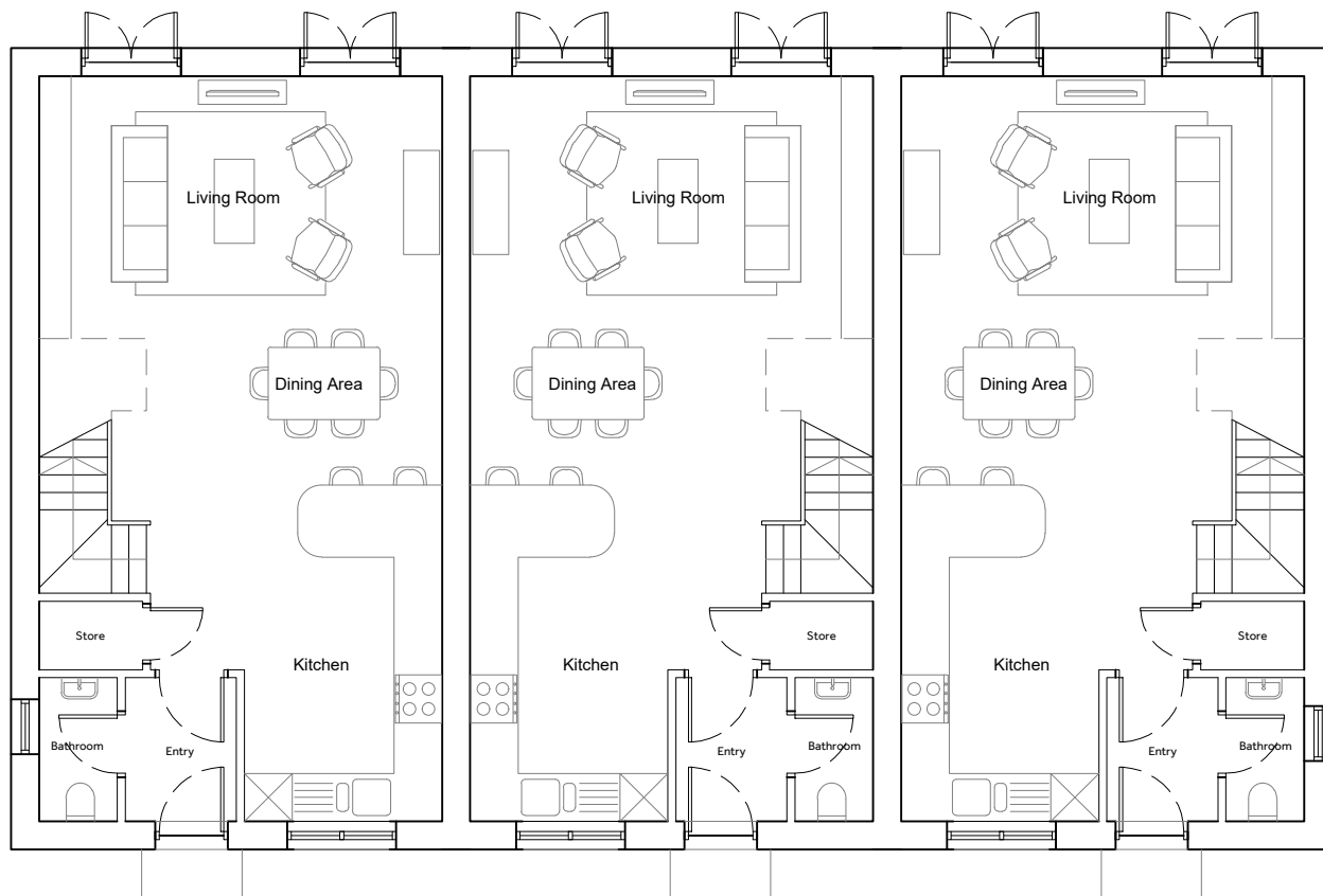
Ground Floor Plan 1:100 @ A3