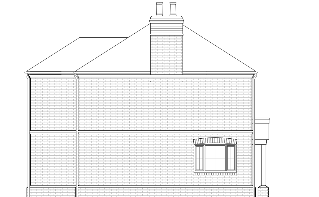
Right Elevation 1:100 @ A3