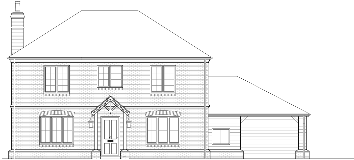
Front Elevation 1:100 @ A3