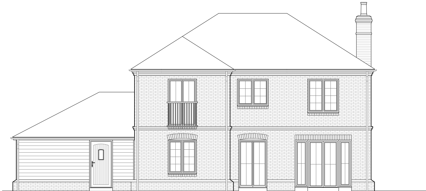
Rear Elevation 1:100 @ A3