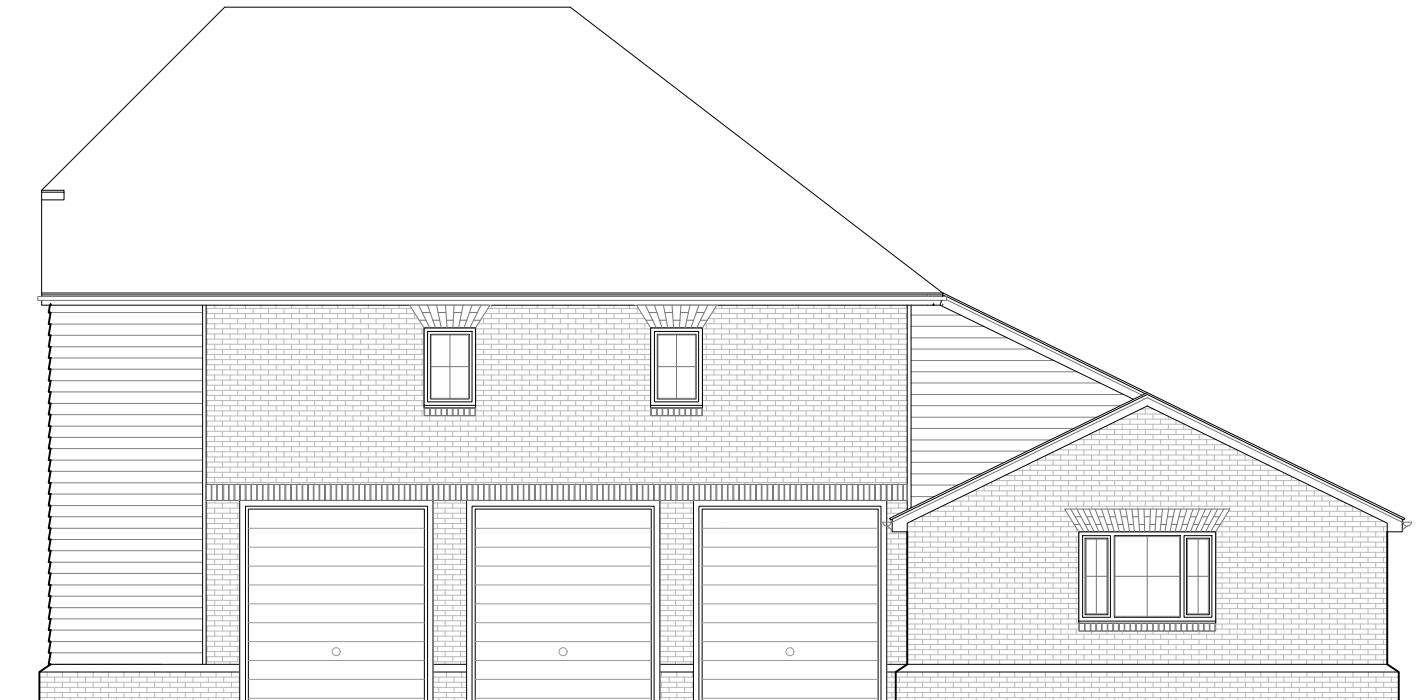
Rear Elevation 1:100 @ A3