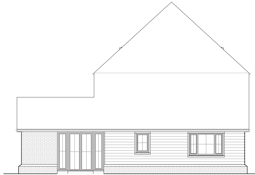
Left Elevation 1:100 @ A3