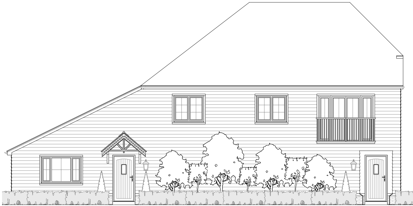
Front Elevation 1:100 @ A3