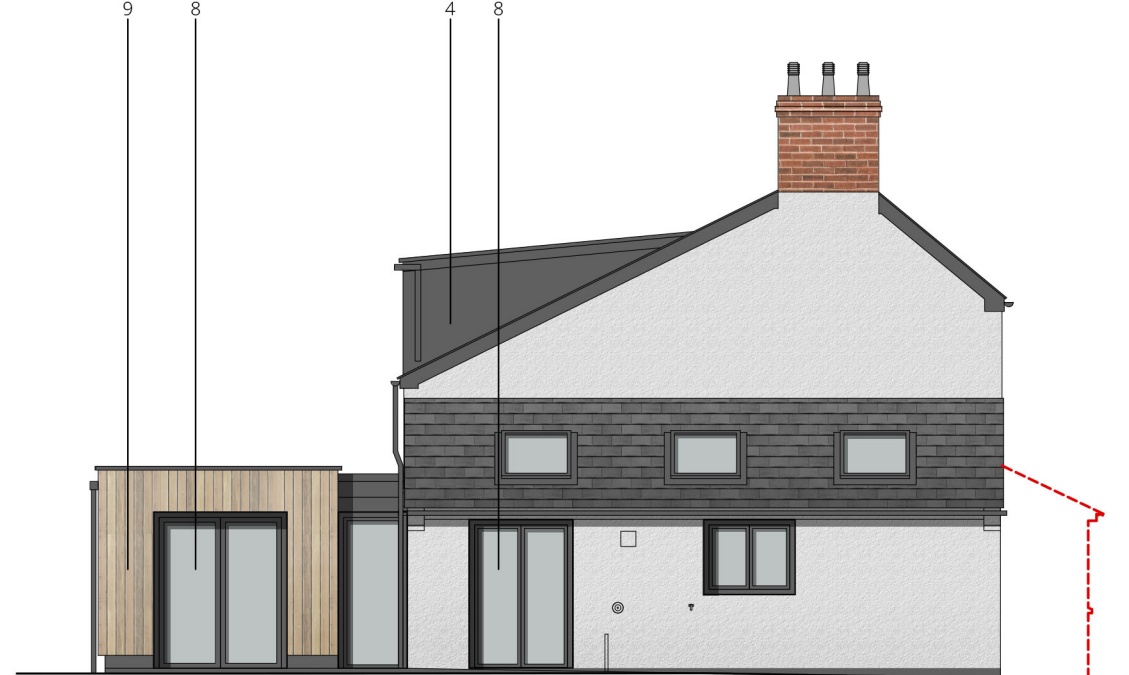
| Side Elevation (East)