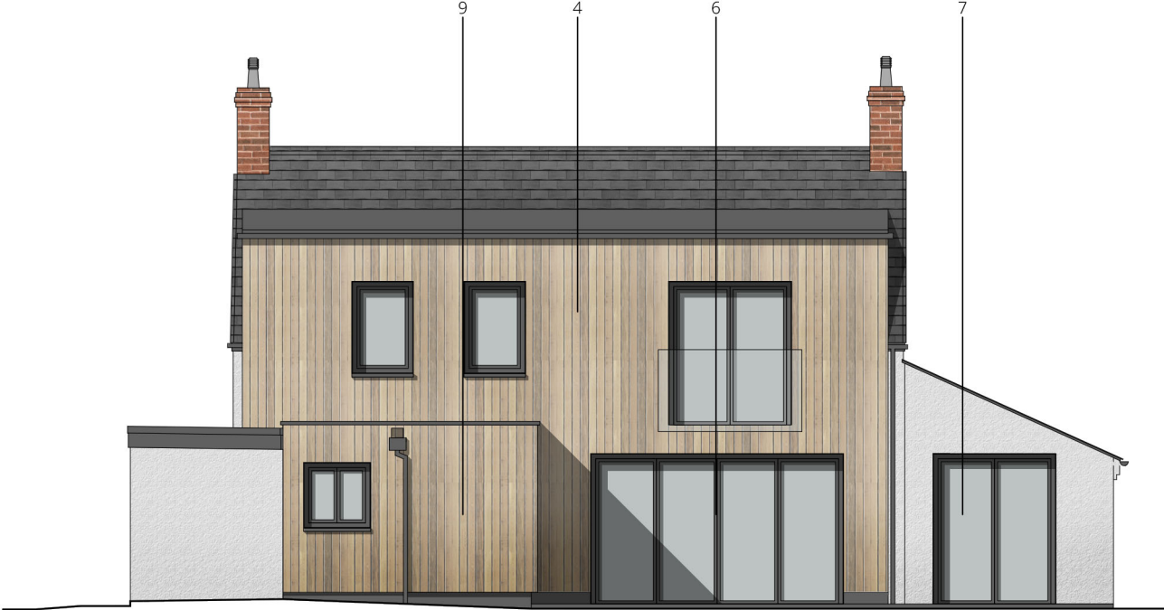
| Rear Elevation