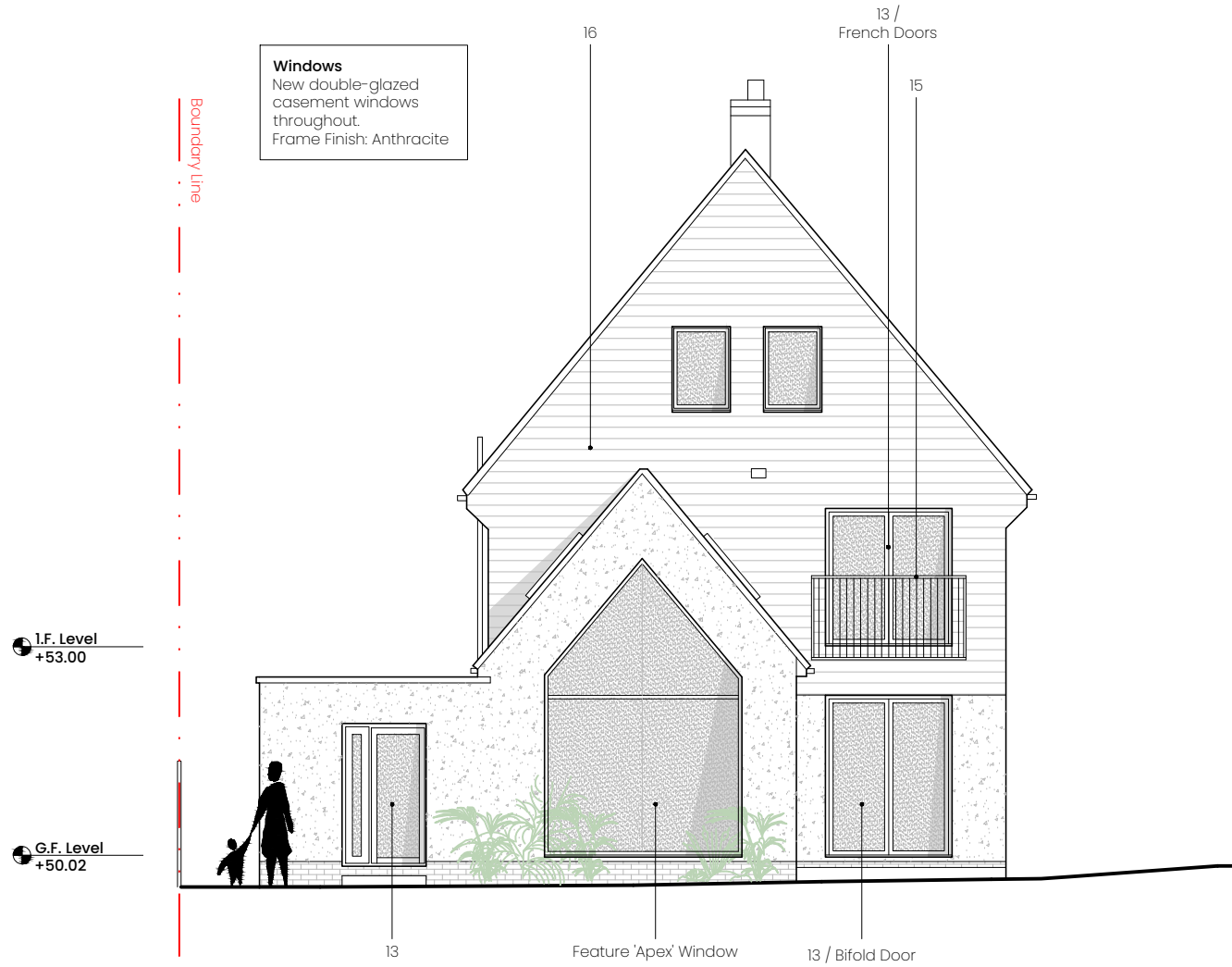
Approved North-West Elevation (Rear) (Application Ref: 22/02479/FUL)

Windows New double-glazed casement windows throughout. Frame Finish: Anthracite