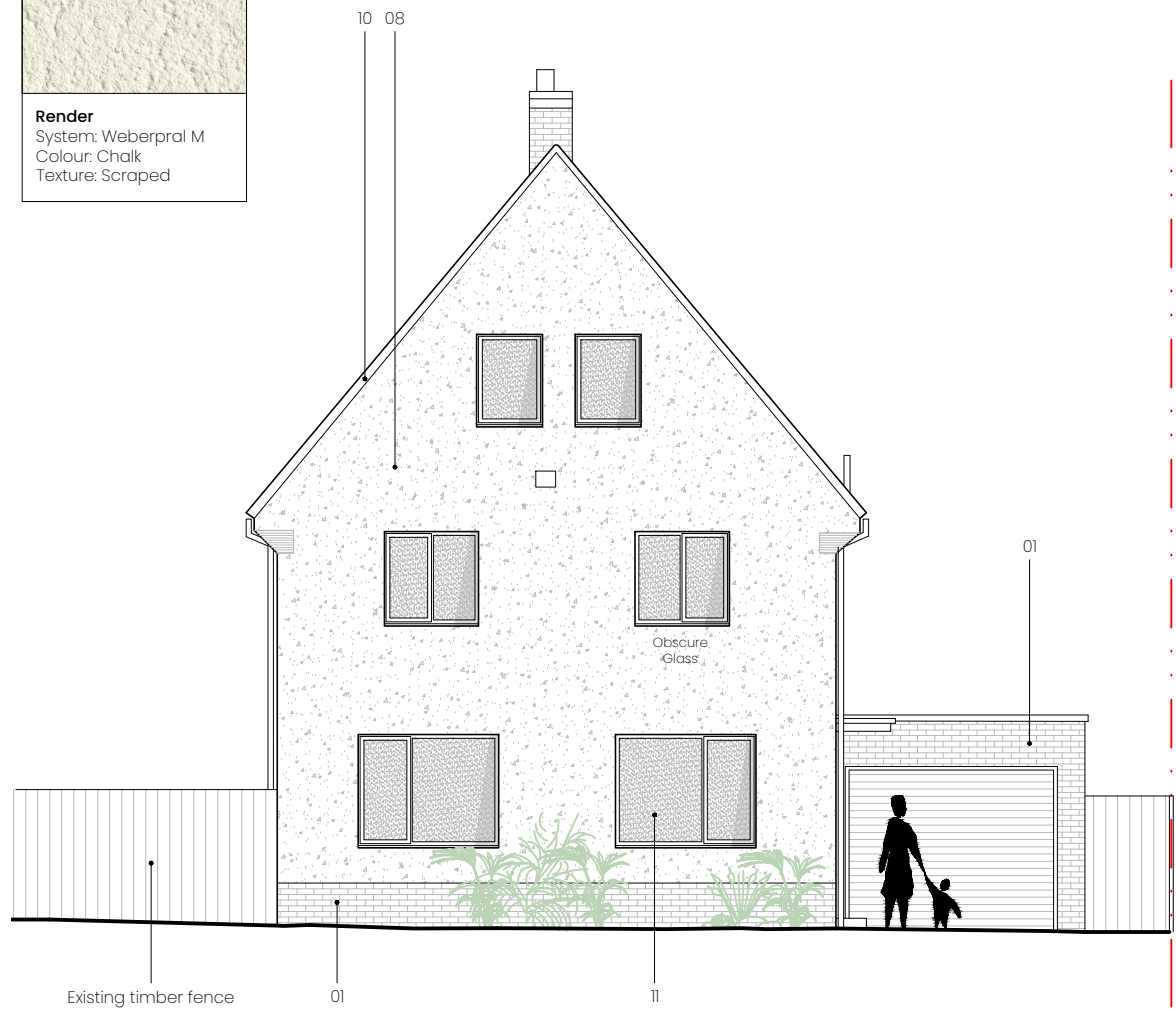
Proposed South-East Elevation (Front)

Render System: Weberpral M Colour: Chalk Texture: Scraped