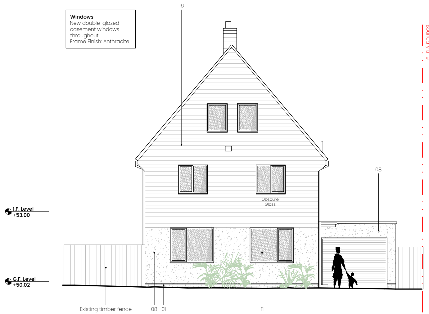
Approved South-East Elevation (Front) (Application Ref: 22/02479/FUL)