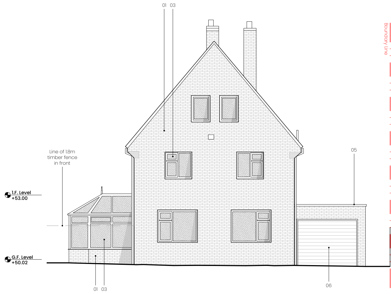
Existing South-East Elevation (Front)