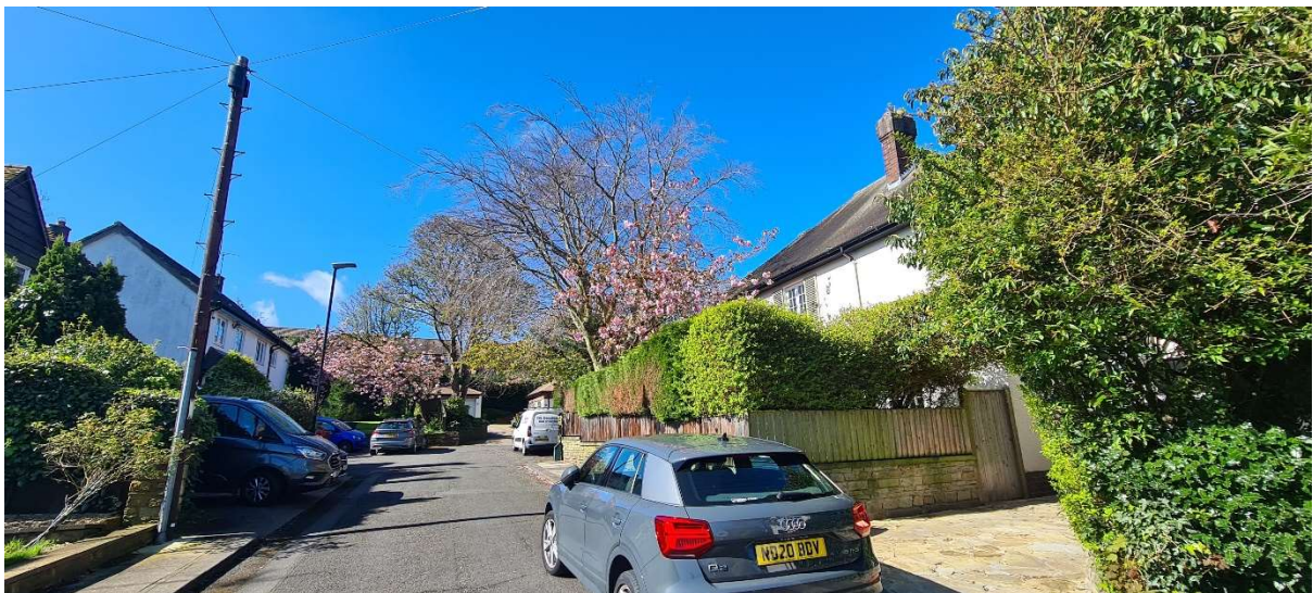
Image 4 Langport Road View looking South

The application has been submitted to Sunderland City Council via the Planning Portal, and includes the following drawings and documentation: