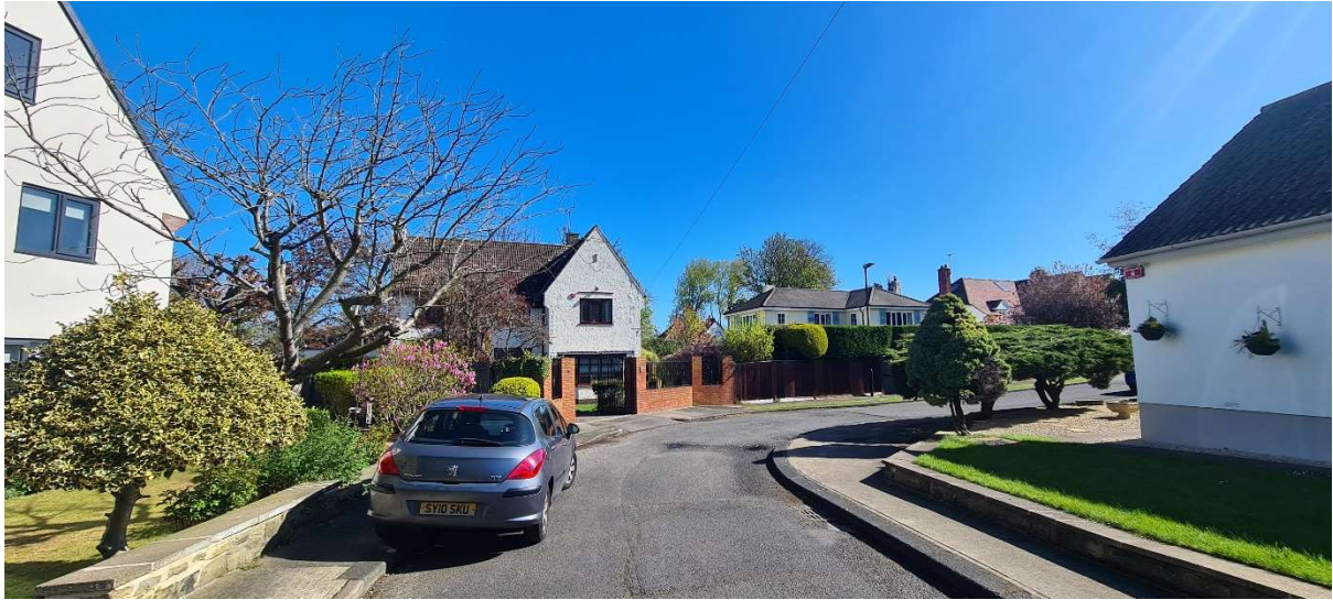
Image 3 Langport Road View looking North

With newly ended elevations, Ke way fits seamlessly within the existing street scene on Langport Road, as a number of neighbouring properties are also fully ended.