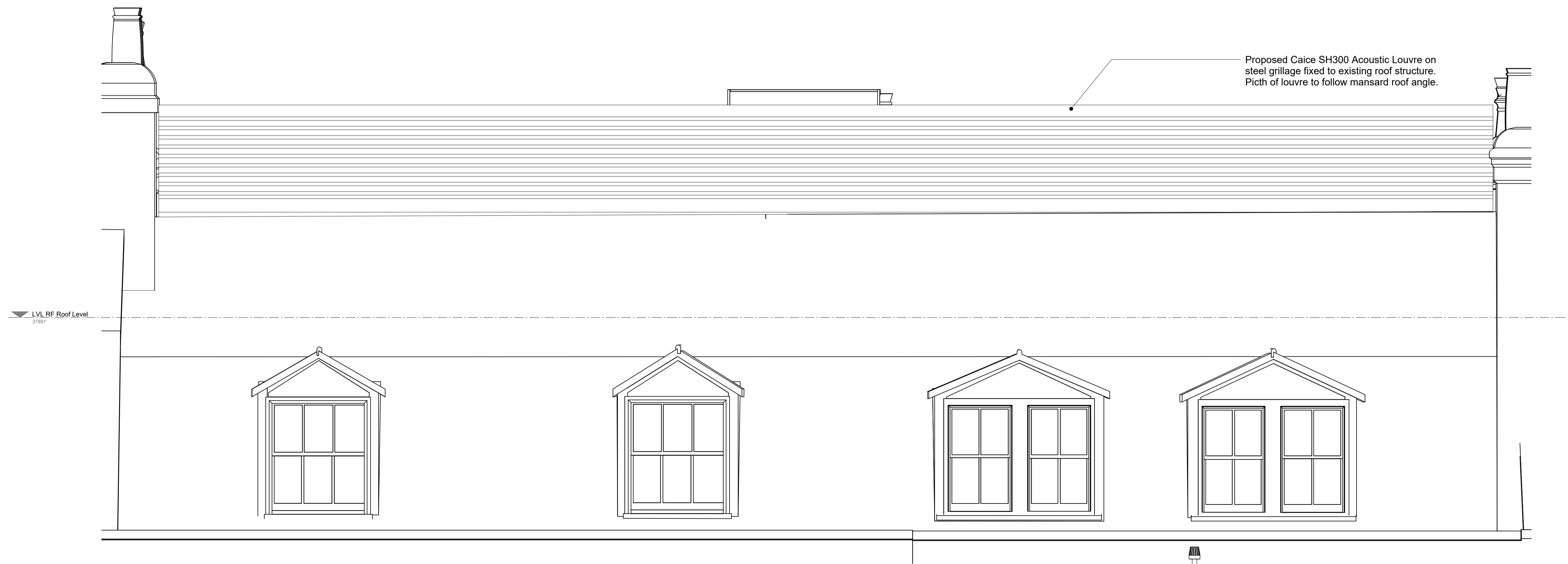
2 Acoustic Louvre - Elevation 2 CST-STA-DD-RF-DR-A-A4070 1 : 25