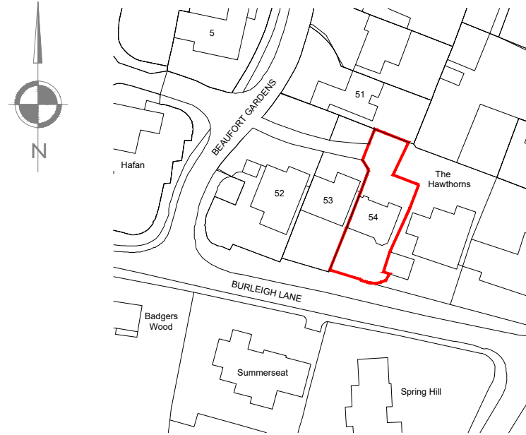
Site Location Plan Ordnance Survey 100053143