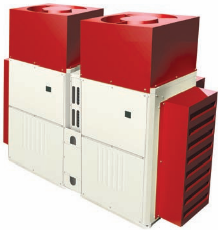
■ Example of a CAHV Acoustic Kit

Mitsubishi Electric offer a range of Acoustic Kits designed for noise reduction. An industry first, these kits offer up to an 8dBA noise level reduction and are available to use with both our CAHV and CHU Ecodan models.