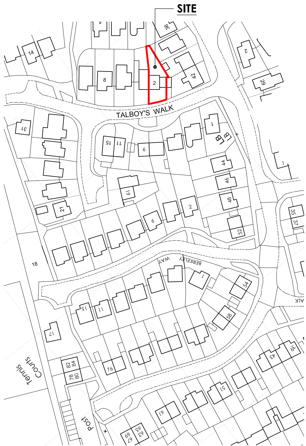
SITE LOCATION PLAN @ 1:1250