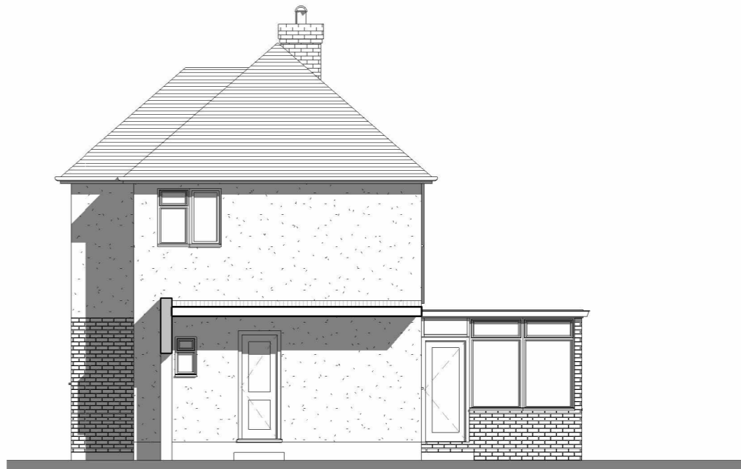
4 Existing Side 2 Elevation 1 : 100