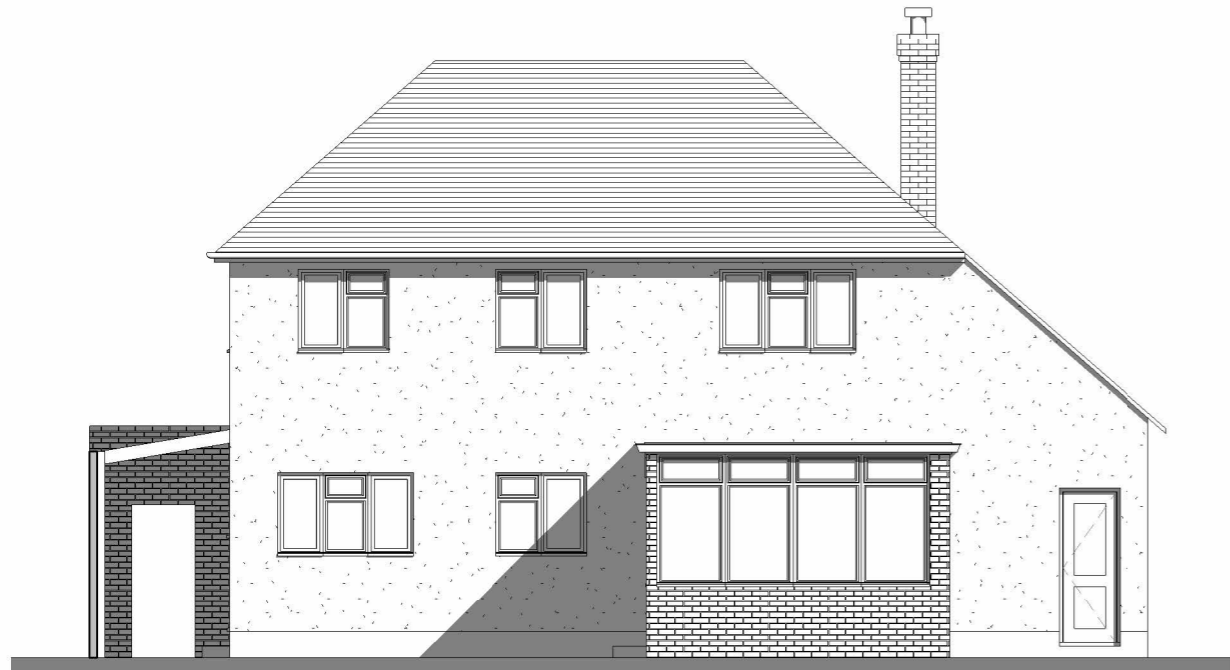
3 Existing Rear Elevation 1 : 100