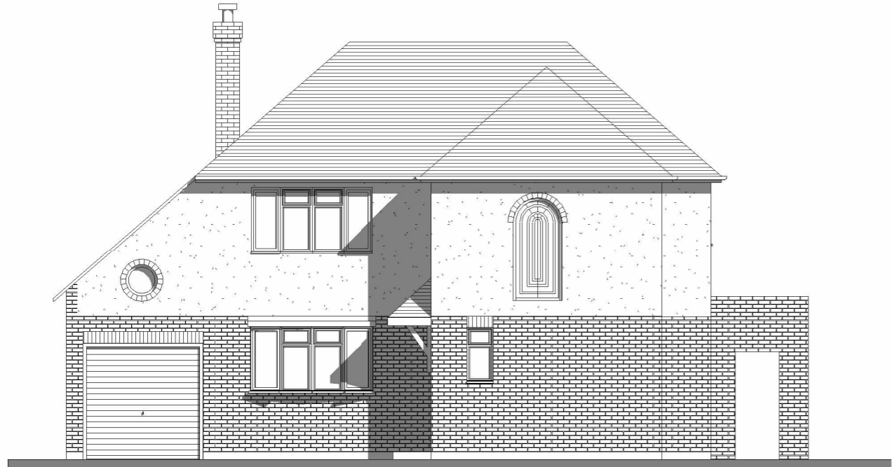
1 Existing Front Elevation 1 : 100