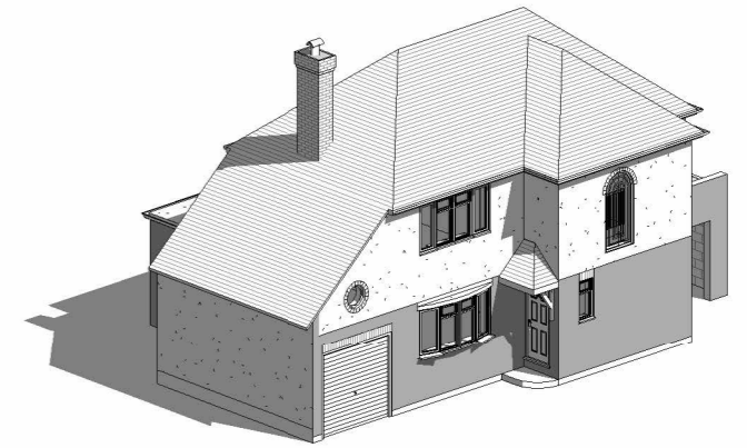
3 3D View 1