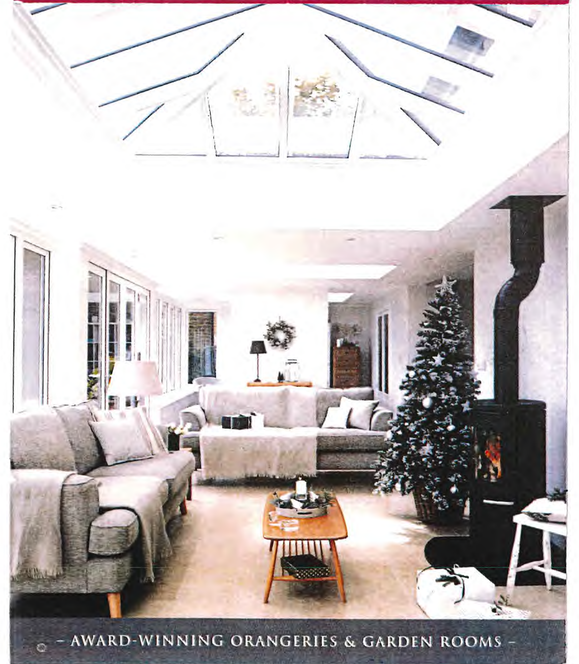
- AWARD-WINNING ORANGERIES & GARDEN ROOMS -