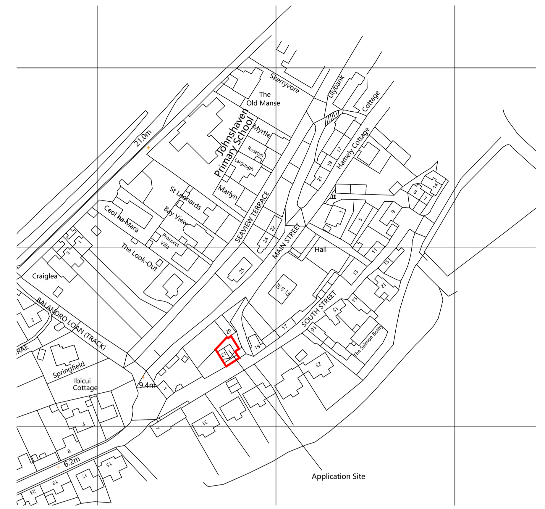
Proposed Location Plan - 1:1250