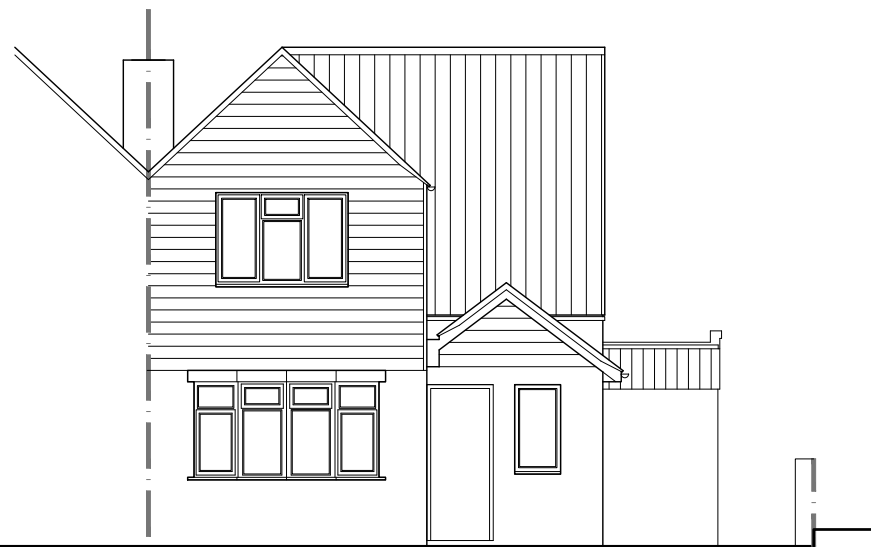
Existing Front Elevation scale 1:100