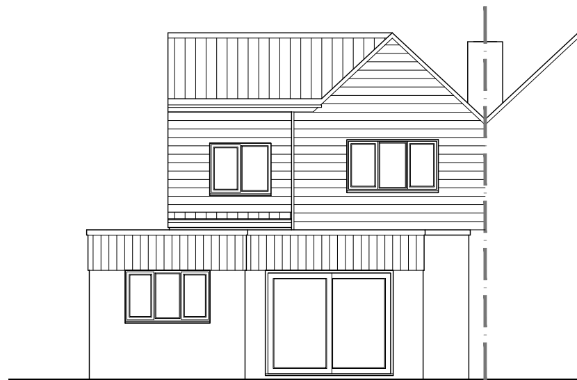
Existing Rear Elevation scale 1:100