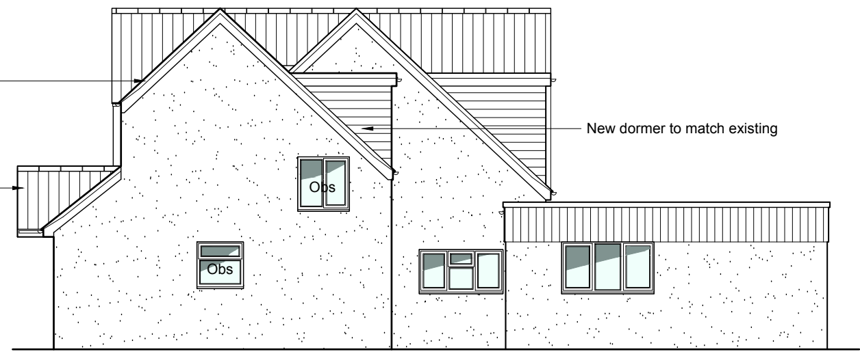
Proposed Side Elevation scale 1:100