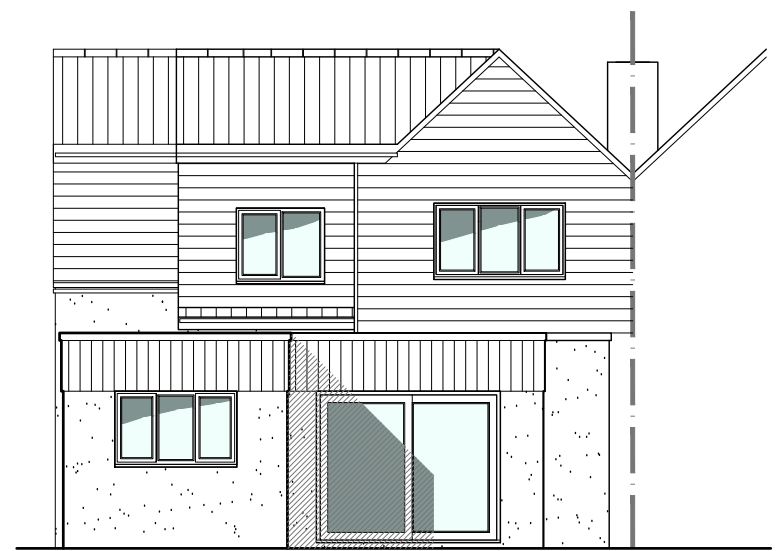
Proposed Rear Elevation scale 1:100