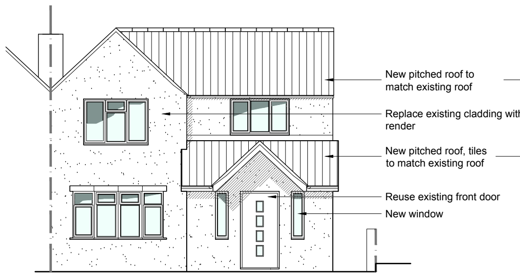
Proposed Front Elevation scale 1:100

All levels and dimensions are approximate