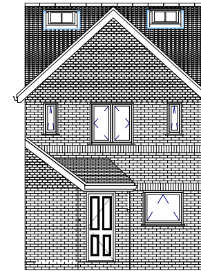
2 Proposed Front 1 : 100