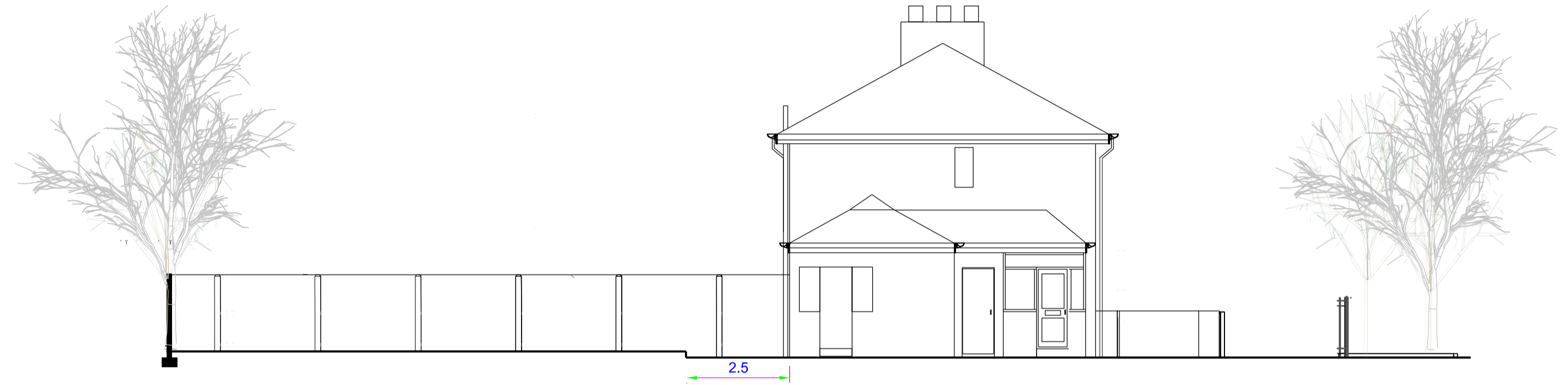
Existing Side View