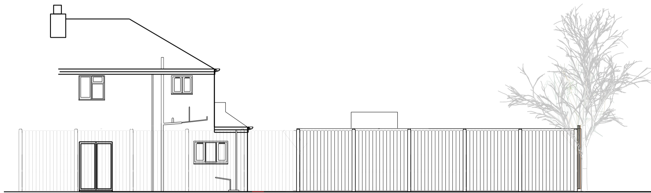
Existing Back View