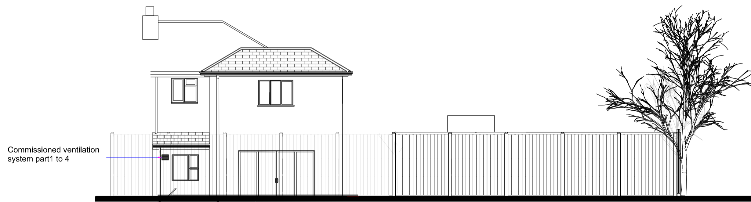
Proposed Back View