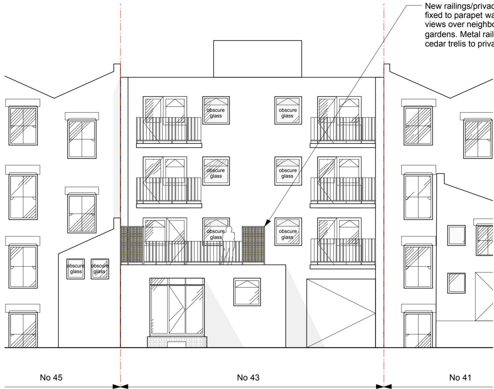
2. PROPOSED REAR ELEVATION