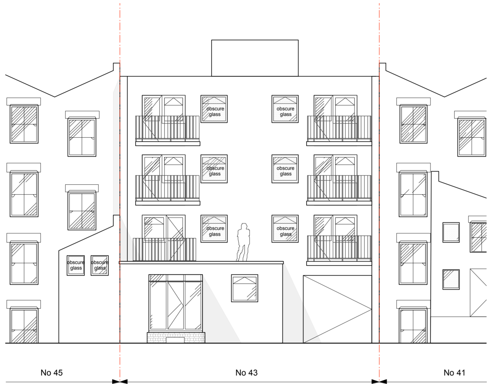
1. EXISTING REAR ELEVATION