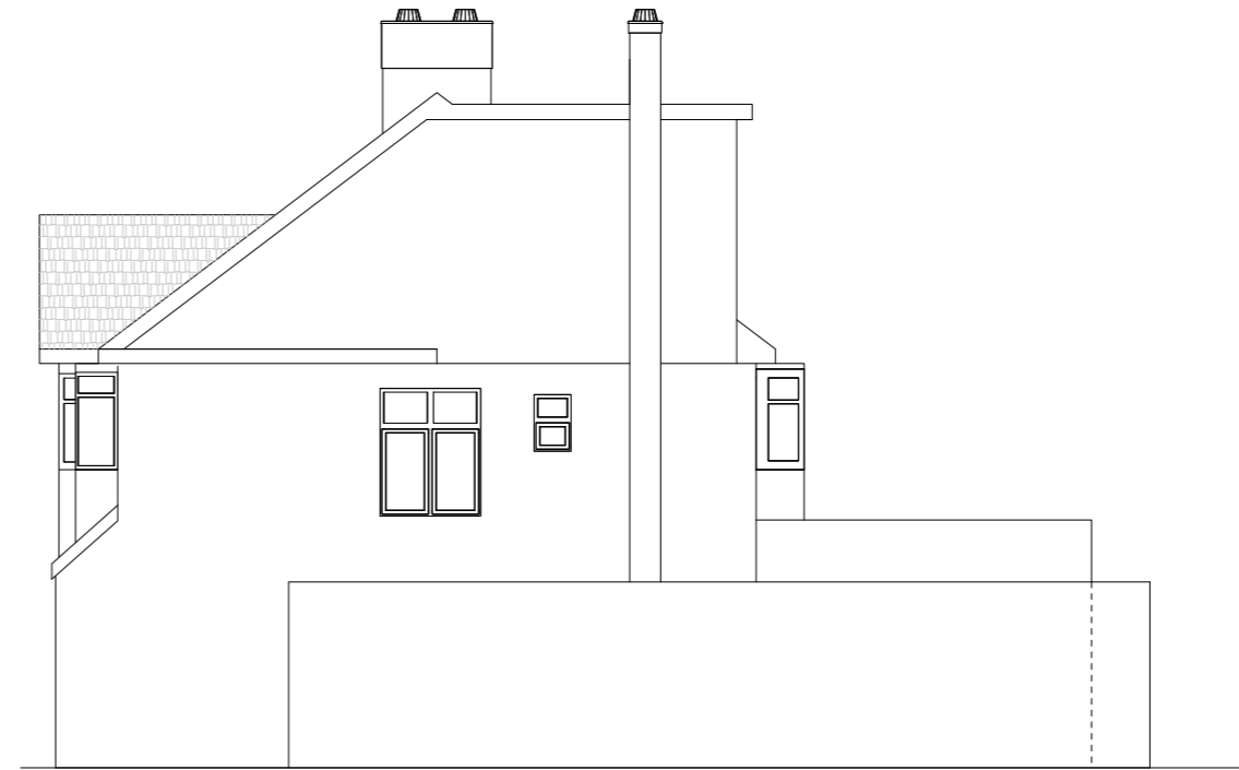
Existing Side Elevt Side (Right Side)