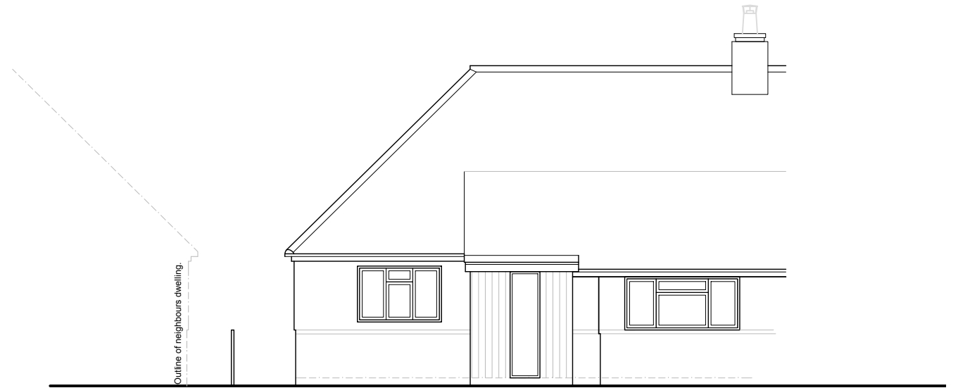
East Elevation | existing