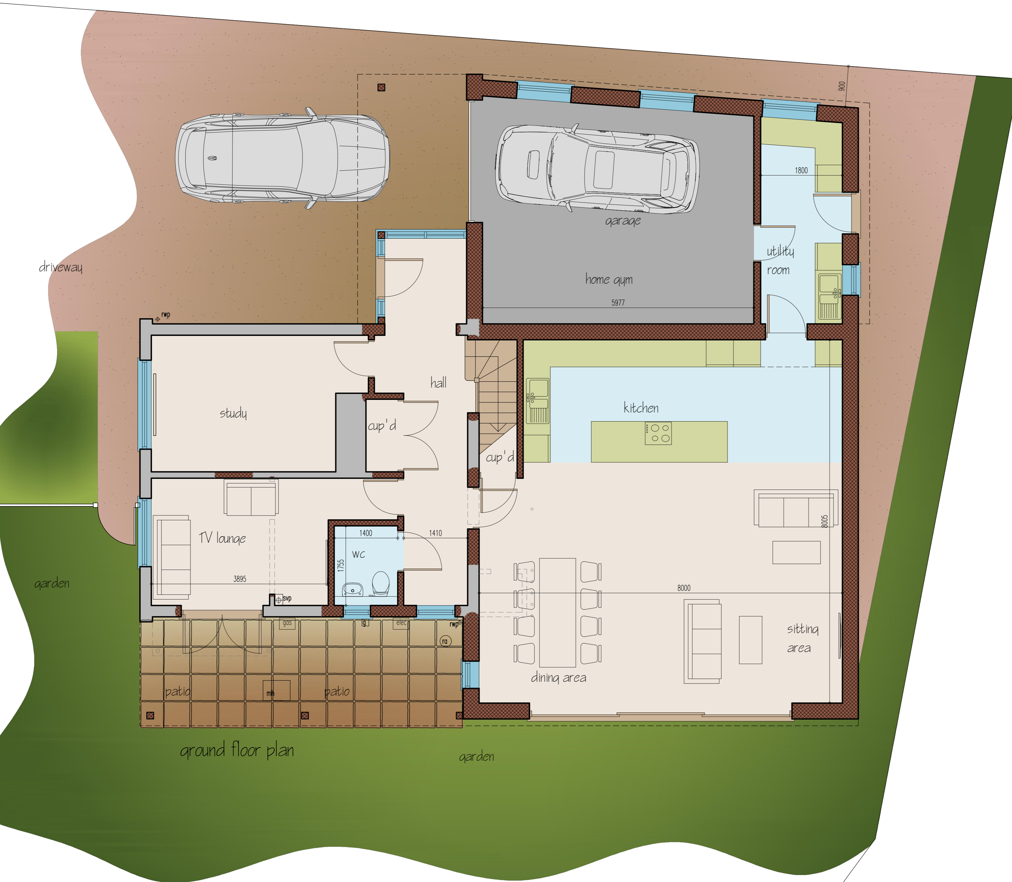
ground floor plan