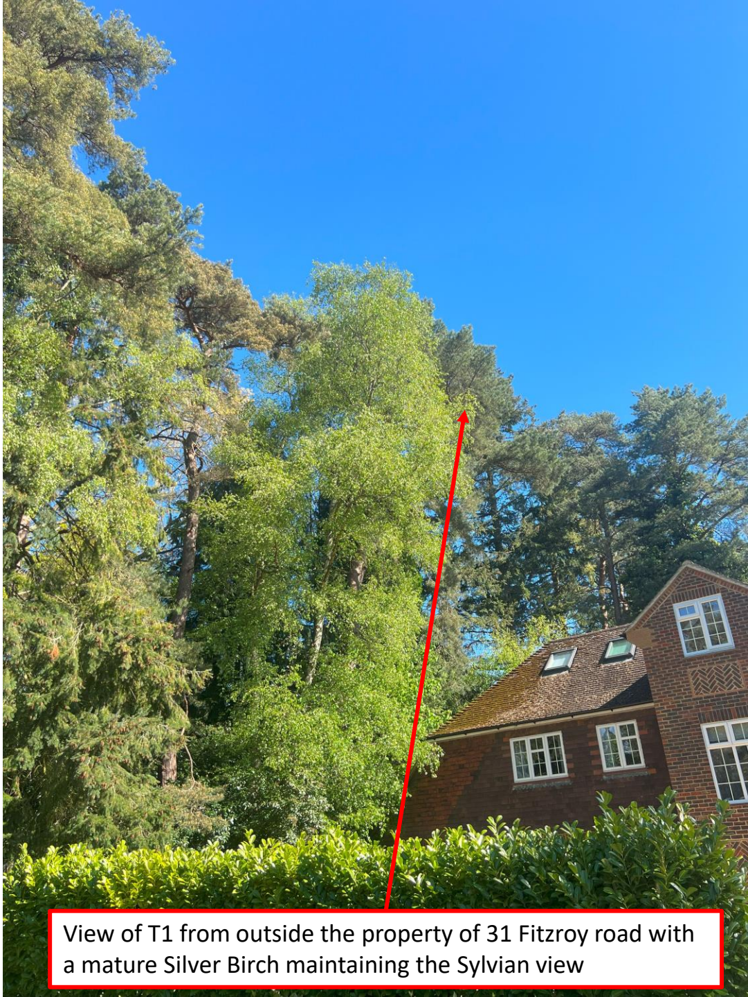
View of T1 from outside the property of 31 Fitzroy road with a mature Silver Birch maintaining the Sylvian view