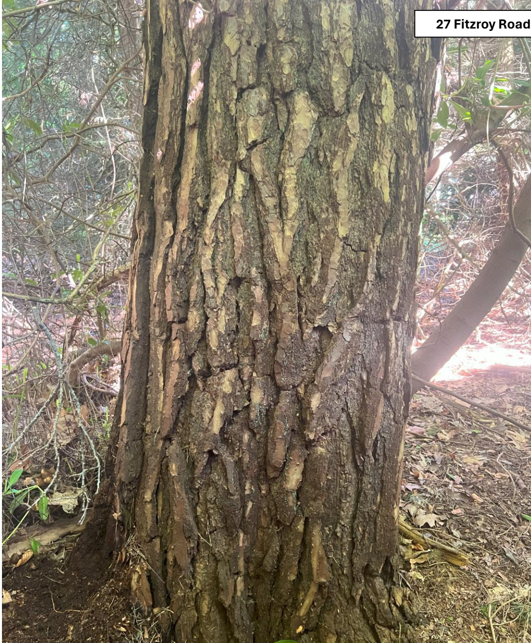
The base of T1 900mm DBH with a lack of pronounced buttressing to the Southwest.