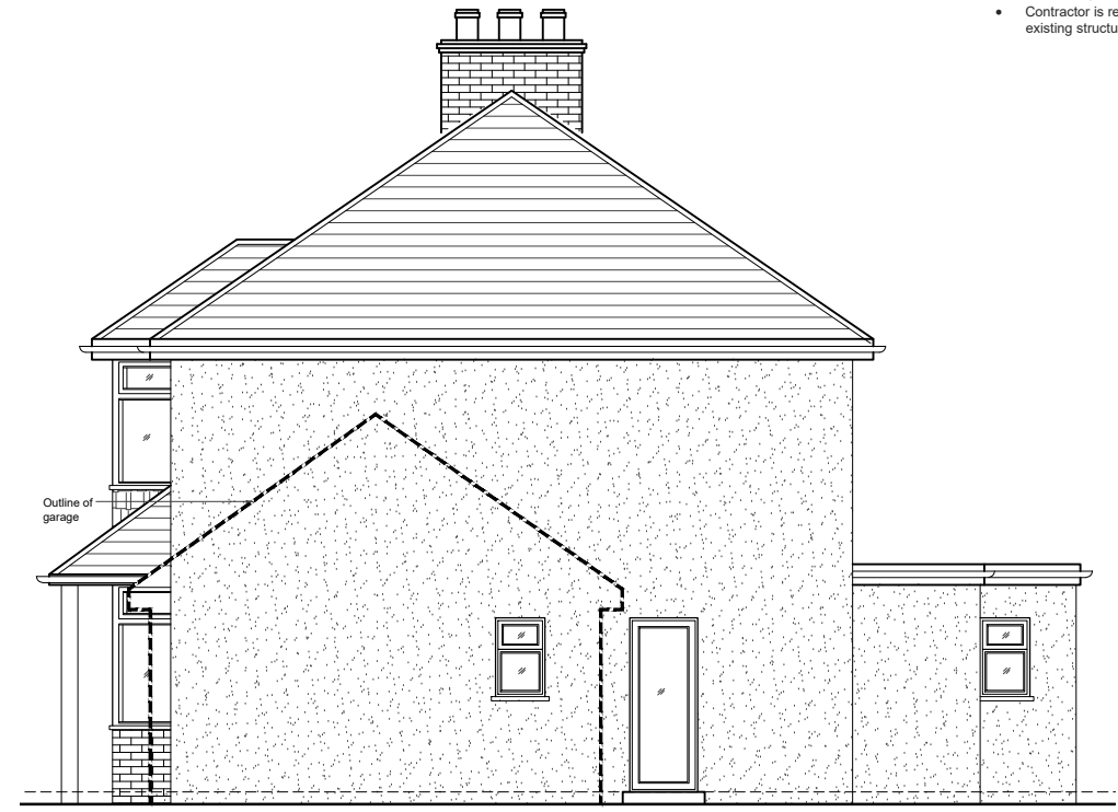
02 - RIGHT SIDE ELEVATION