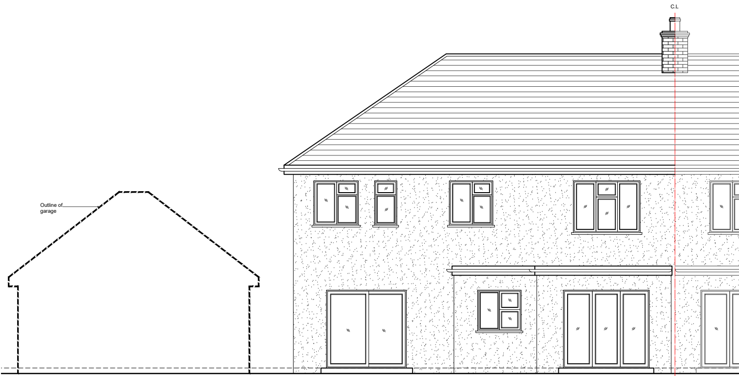
03 - REAR ELEVATION