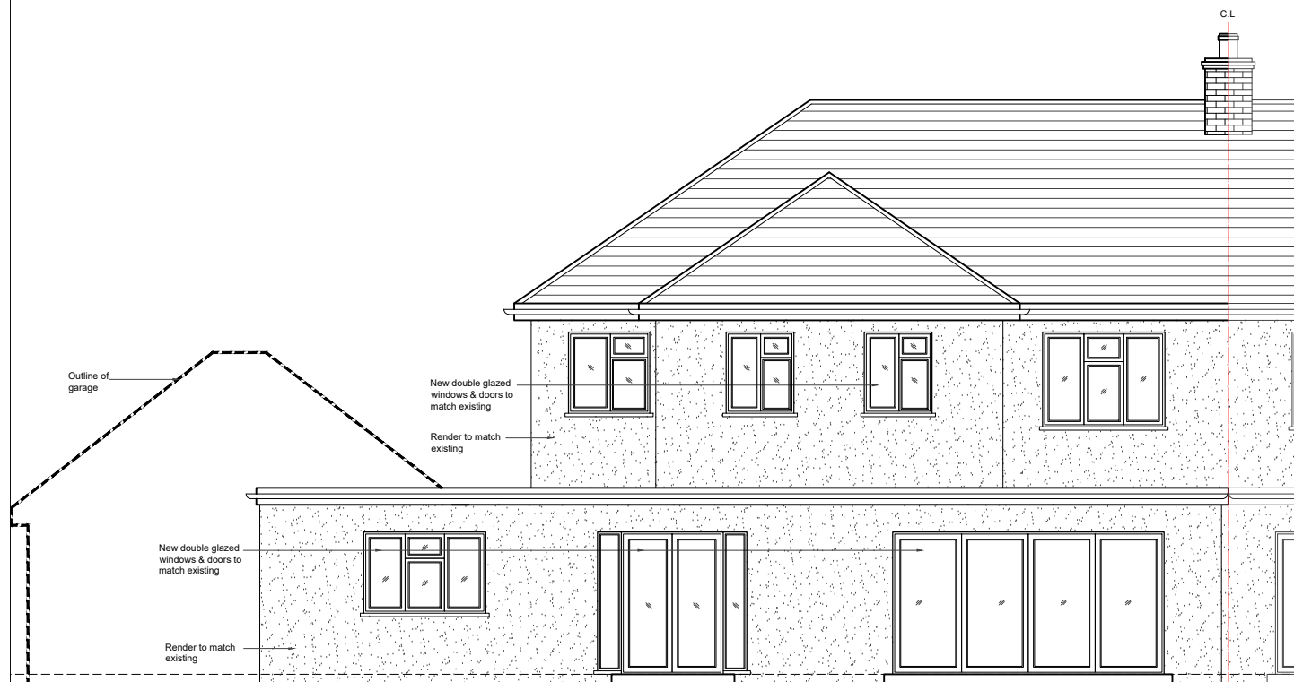
03- REAR ELEVATION