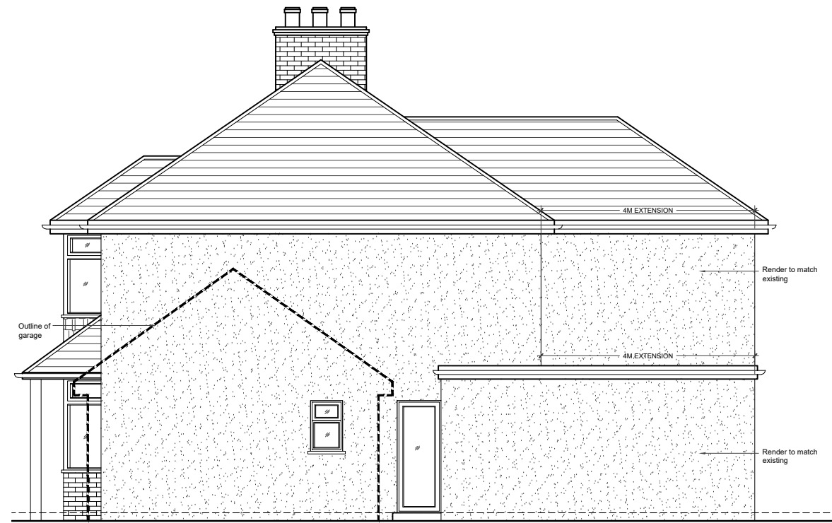
02- RIGHT SIDE ELEVATION