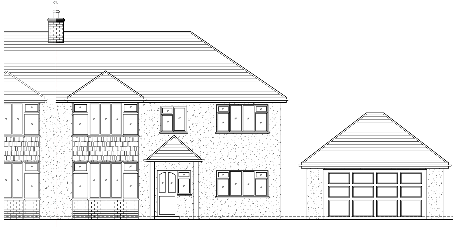
01 - FRONT ELEVATION