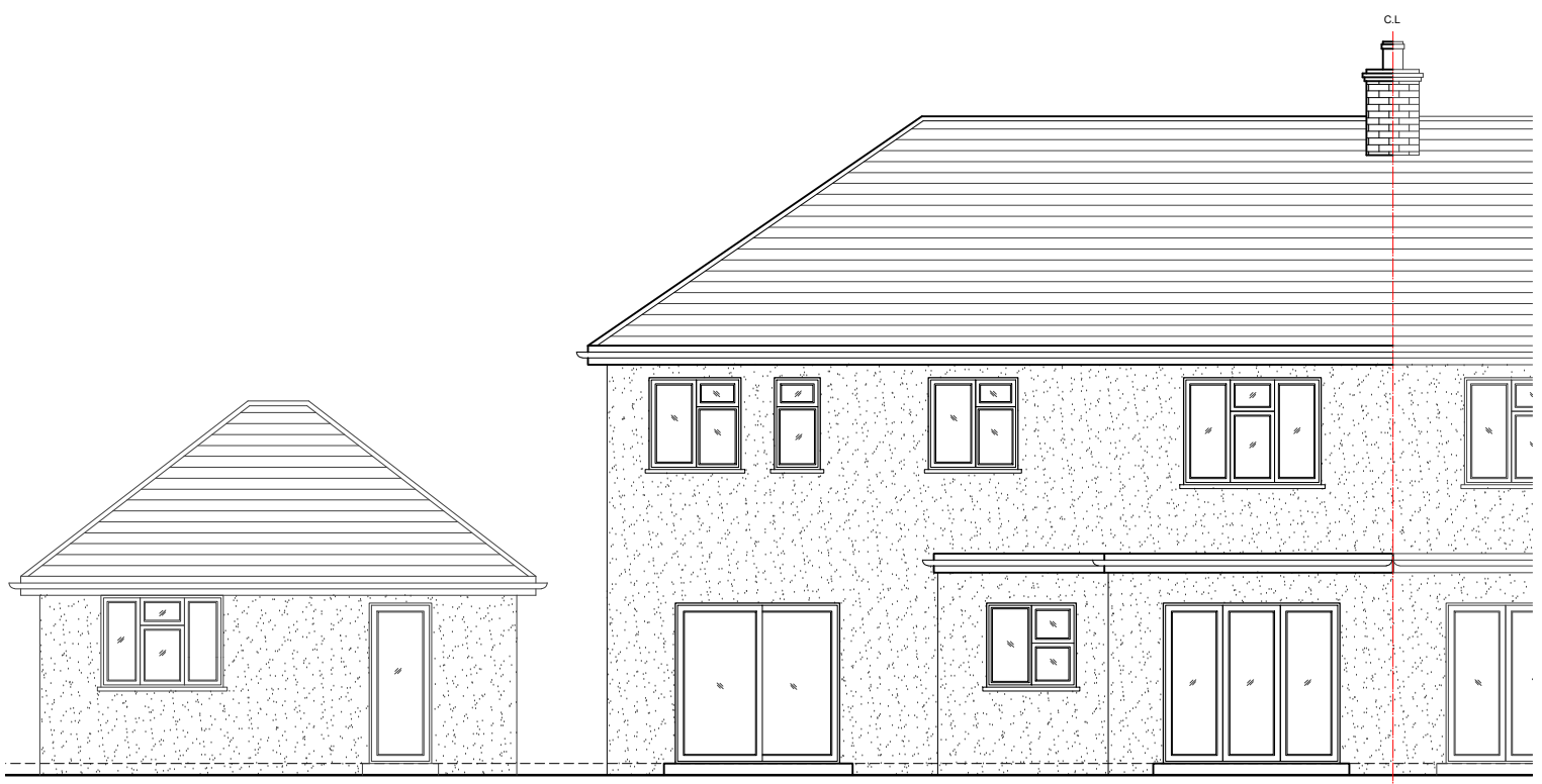
03 - REAR ELEVATION