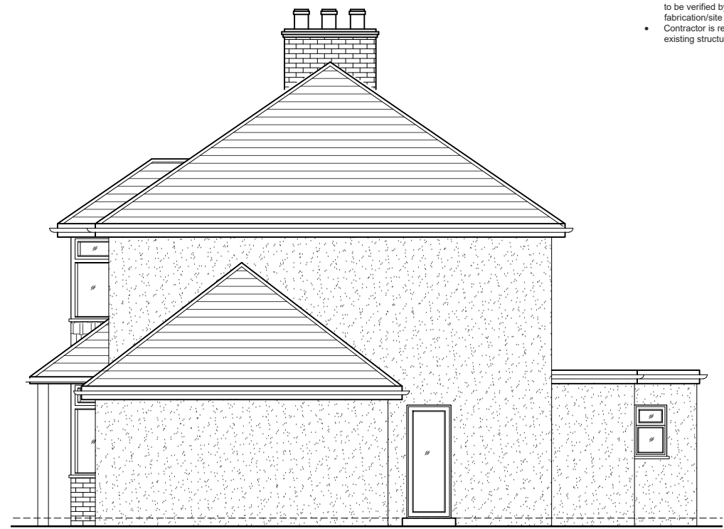
02 - RIGHT SIDE ELEVATION