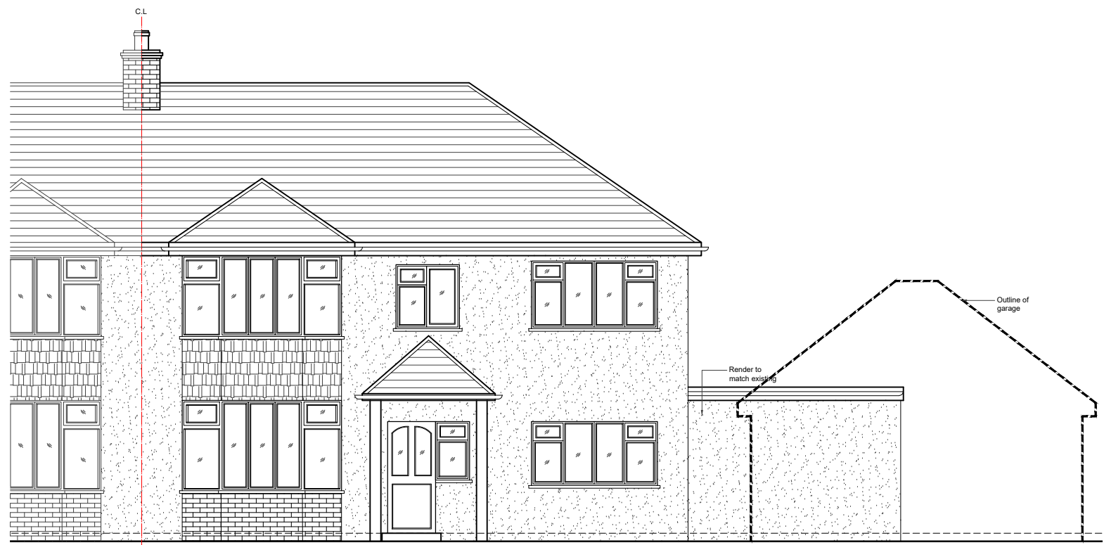
03- FRONT ELEVATION