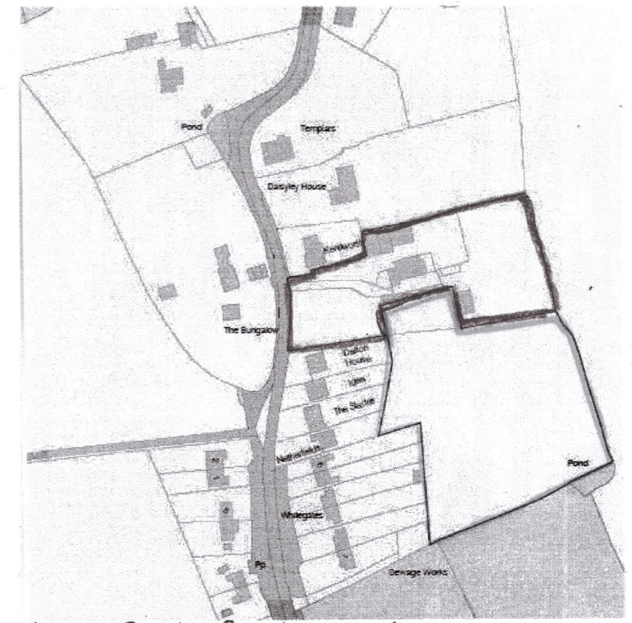
LOCATION PLAN 1:2500 PRINT @ A3 SHEET SIZE