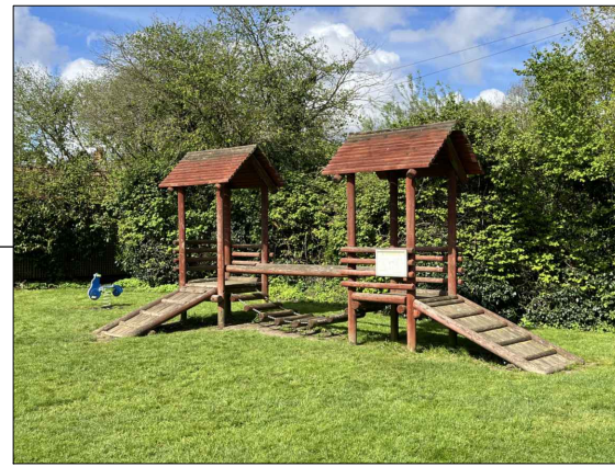
existing climbing frame