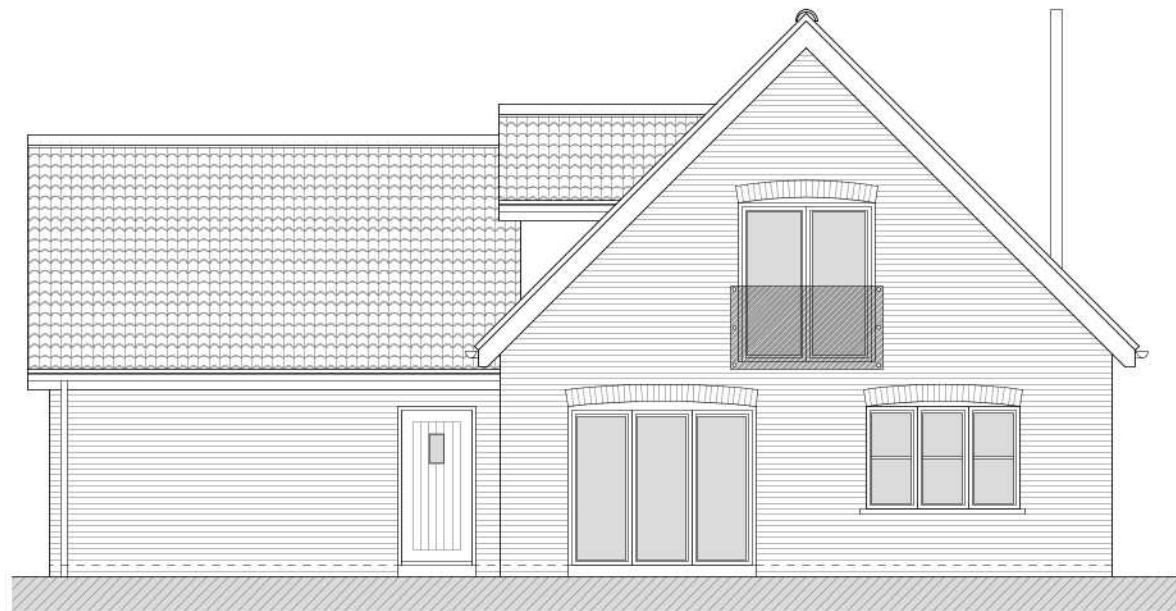
REAR / EAST ELEVATION