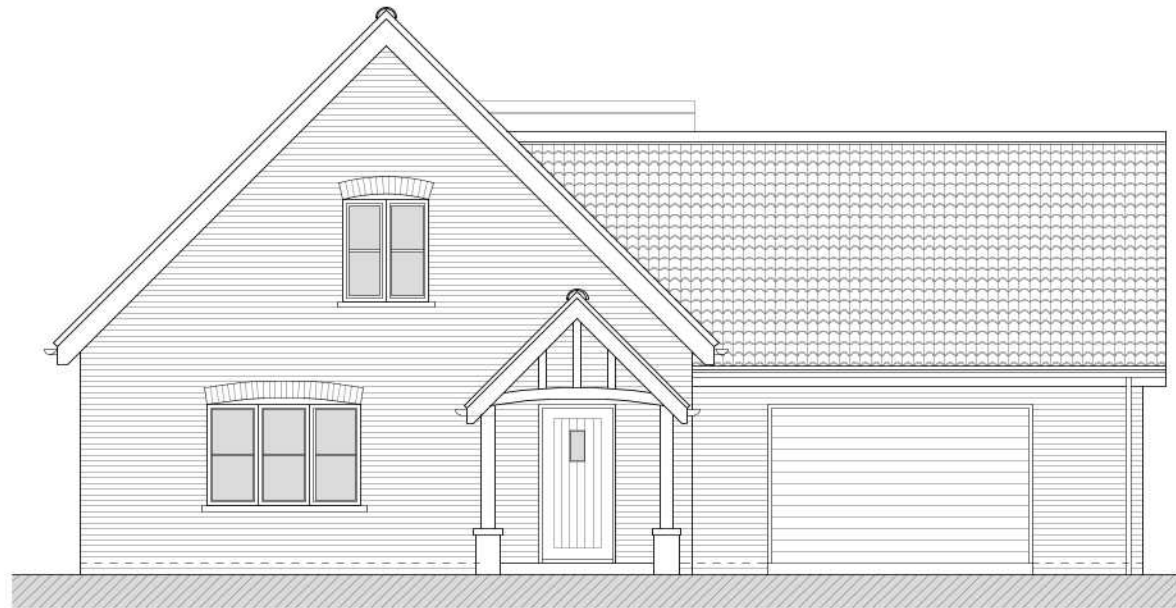
FRONT / WESTERN ELEVATION