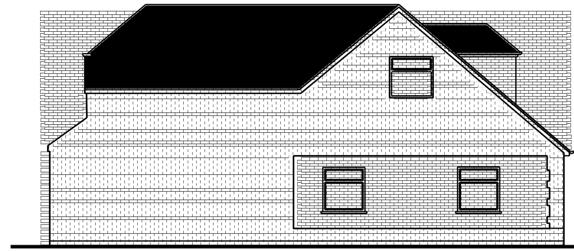
5 North Elevation Existing Scale: 1:100