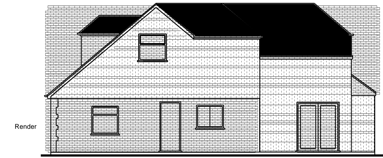
6 South Elevation Existing Scale: 1:100