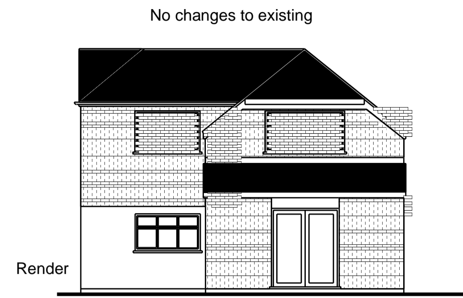
4 Rear Elevation Existing Scale: 1:100