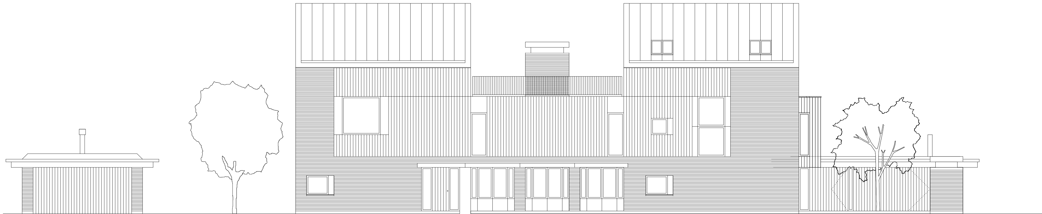
Garage and studio pavilion