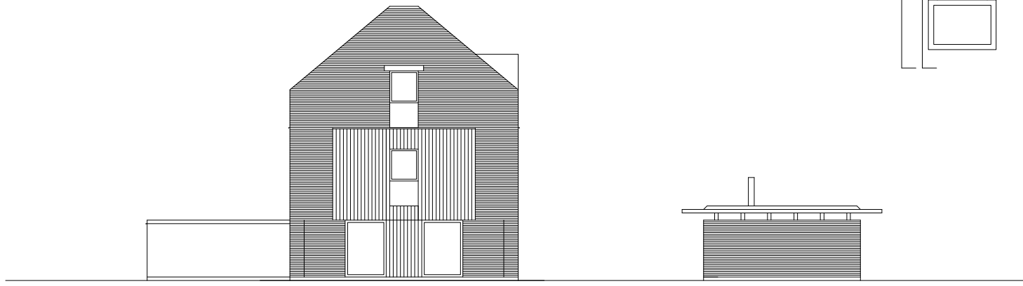
Elevation from patio