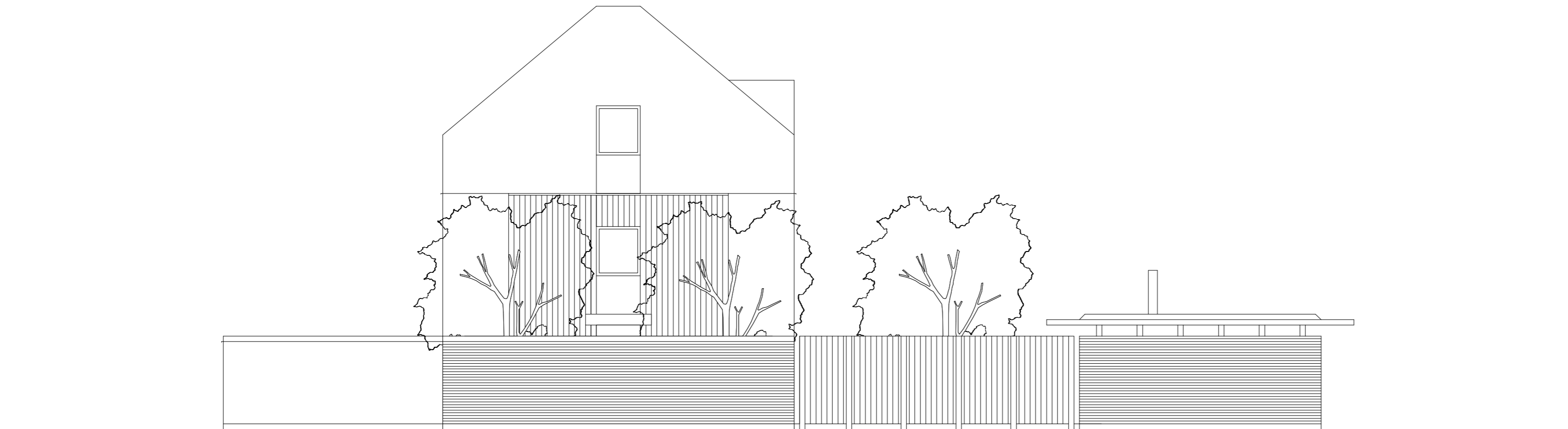
Elevation from site boundary