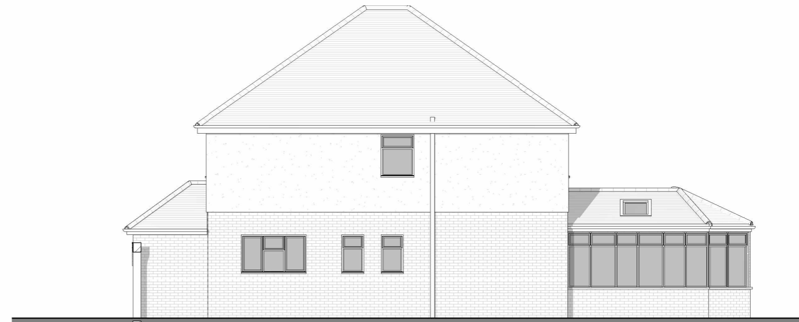
Side 2 Elevation