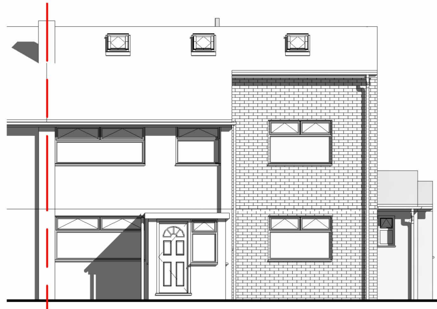
2 Proposed S-East Elevation 1 : 100