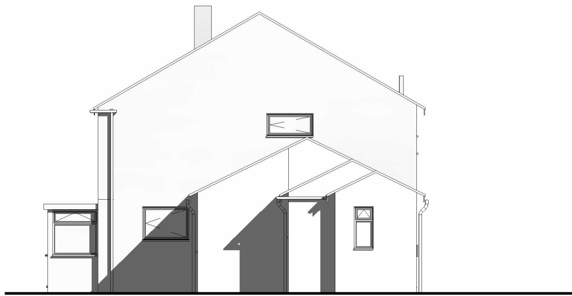
1 Existing N-East Elevation 1 : 100