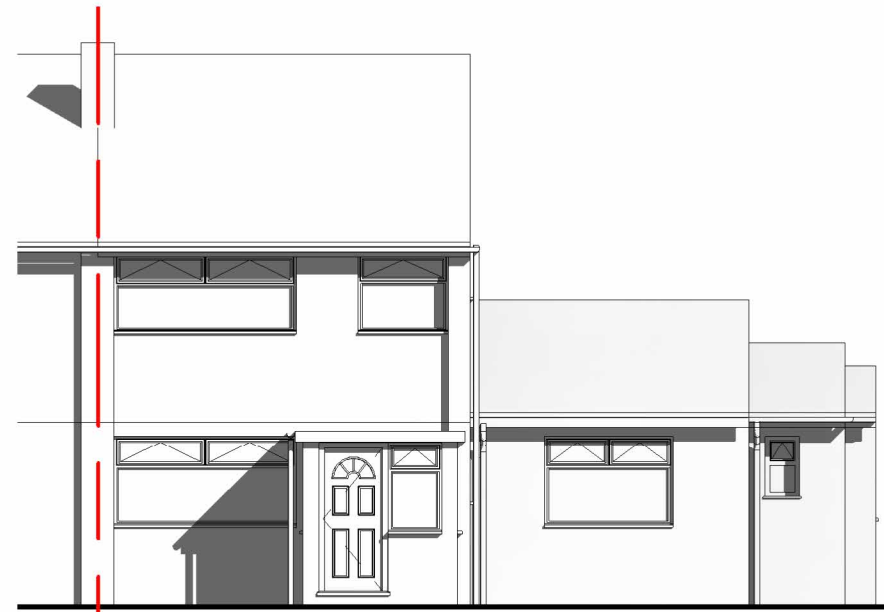
2 Existing S-East Elevation 1 : 100