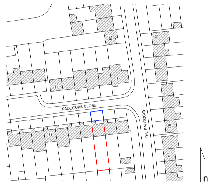
Site Plan 1/1250

note — owned by applicant — owned by STEVENAGE BOROUGH COUNCIL